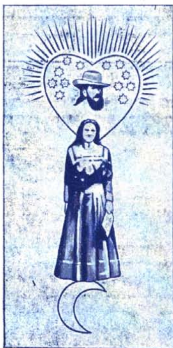
Designed by Benjamin.

THE LORD is on My head like a Crown, and I shall not be without Him. They wove for Me a crown of truth, and it caused Thy branches to bud in Me. For it is not like a withered crown which buddeth not; but Thou livest upon My head, and Thou hast blossomed upon My head. Thy fruits are full-grown and perfect; they are full of Thy salvation. Odes of Solomon 1, 1-4.