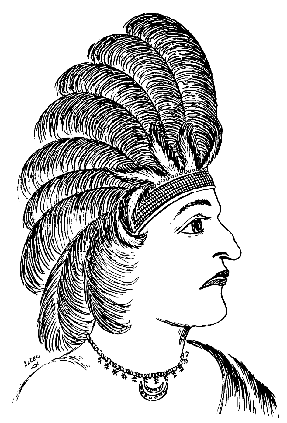
THE LAST OF THE AZTECS