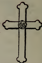
THE ROSAE CRUCIS