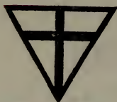
GENERAL SYMBOL OF THE ORDER IN THE WORLD

THE SYMBOLS AND SEALS SHOWN BELOW ARE THE ONLY TRUE EMBLEMS OF THIS ORDER, AND DISTINGUISH THIS ORDER FROM ALL OTHERS