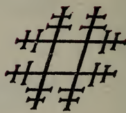
SACRED INSIGNIA OF THE IMPERATOR