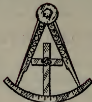
EMBLEM WORN BY THE MEMBERS