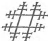
SACRED INSIGNIA OF THE IMPERATOR