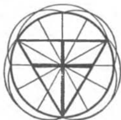
THE GREAT SEAL OF THE ORDER IN AMERICA