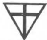
GENERAL SYMBOL OF THE ORDER IN THE WORLD

THE SYMBOLS AND SEALS SHOWN BELOW ARE THE ONLY TRUE EMBLEMS OF THIS ORDER. AND DISTINGUISH THIS ORDER FROM ALL OTHERS