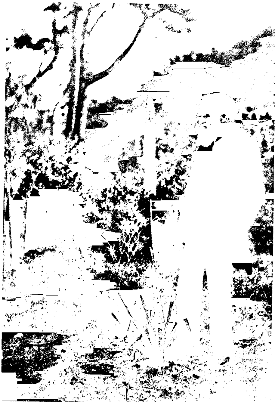
A. R. WALLACE ADMIRING EREMURUS ROBUSTUS about 1905,