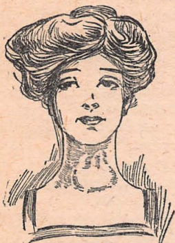
A Small Goitre of the Parenchymatous Type.

Next in frequency of occurrence and of even more seriousness than those just mentioned are the symptoms arising from a disturbance of the heart and circulation.