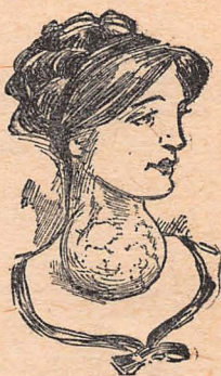
A Vascular Goitre.

You should not come to me and pay your money for my time unless you really want to get well and are willing to do as I tell you. If you want to treat yourself, or if you are not willing to follow my instructions to the letter, then do not bother me by taking up the time I might better devote to someone who is really in earnest. Go to someone else. My time is valuable. I am busy all the time. I cannot afford, for the ridiculously low fee I ask, to spend my time upon people who will not abide by my instructions and give me their every help. I would a hundred times rather you would not write me until you are dead in earnest—until you do really want to get well and are willing to do all in your power to aid me. I cannot cure you in spite of yourself. No man can do that. You must help, and you can do that by faithfully and earnestly co-operating with me, taking the remedies faithfully and giving me your earnest and honest assistance.