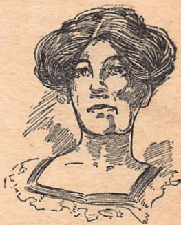
A Fibrous Tumor—Not Goitre.

Another peculiarity of Goitre that has considerable diagnostic value in some cases is the sudden appearance of the swelling following severe mental shock, fright or great emotion. Should an enlargement develop on the neck after any of these causes, or childbirth, or any great physical strain, the chances are many to one that it is goitrous, even though it presents no other symptom than the swelling or tumor.