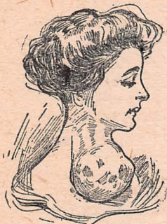
A Nodular Goitre.

organs and tissues of the body or he can never succeed. Treating a symptom or all of the symptoms, even, will not Cure the disease, because the symptom is not the disease, but merely the sign of it, and the suppression of the symptoms with stimulants or sedatives, as the case may be, only blinds the physician, as well as the patient, to the real danger.