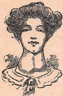
A Double Goitre, So-called because Both Lobes are Involved.

an operation is worse than useless. It only aggravates the Goitre, and in a few months the patient is in a far worse condition than before the operation was performed.