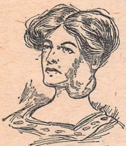
A Tubercular Affection of the Lymphatic Glands of the Neck—Not Goitre.

age of the growth, its Location is always immediately adjacent to the Thyroid gland , which, we have seen, occupies the lower half and front of the neck. (See Anatomical Chart appearing on page 8a.)