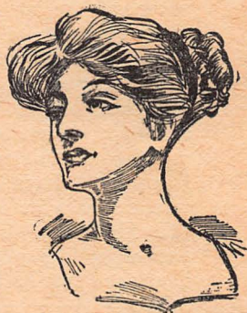
A Normal Neck.

Before taking up the study of the diseased Thyroid gland (Goitre), let us have a moment's glance at the normal or healthy gland. It is only by comparing the gland in health and disease that we can hope to understand the true nature of this disease and be able to account for many of the constitutional derangements that a Goitre causes.