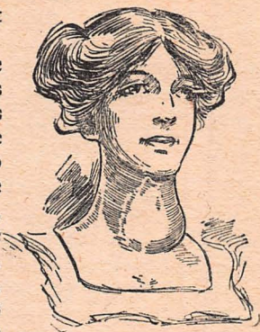
In Which the Body and Left Lobe of the Gland are Involved.

Goitre sufferers are peculiarly susceptible to colds, sore throat, tonsilitis, coughs, etc., and knowing, as we do, the tendency for repeated and neglected colds to lead to catarrh and bronchitis, and finally consumption, Goitre sufferers should take heed of their condition