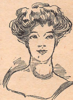
A Fibrous Goitre.

There is a reason—a cause —for every ailment. We do not just walk out on the street and "catch" a sickness. That is the most gigantic lie the medical profession ever worked off on a stupid world. They did it to throw dust in the eyes of the unthinking masses—to cover up their own flimsy equipment and half-baked knowledge concerning the causes and true nature of the diseases they pretend to treat. Such a course is a good deal easier than to get down to hard work and study out why. Besides, it satisfies the sufferer and makes him more patient with the doctor's pretense at treatment and more willing to pay for relief instead of demanding a cure, which the