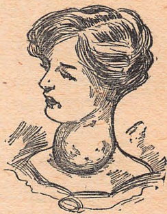
A Large Parenchymatous Goitre Involving the Entire Gland.

The treatment contemplates a thorough systemic renovation. My aim is to build up the bodily health, purify the blood, stop the poisonous Thyroid secretion, and, lastly, cleanse, disinfect and neutralize the gland itself. And then, best of all, I tell you how to live so as to forever prevent a recurrence of the malady.