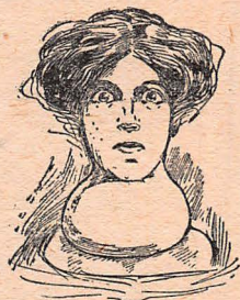
A Large Exophthalmic Goitre, Showing the Protruding Eyeballs.

Thousands are destroyed annually by pneumonia, Bright's disease, la-grippe, consumption and other maladies of the lungs and heart who might have been brought back to health or been saved from contracting the disease at all had not the system been in a weakened and debilitated condition as a result of the undermining influence of the Goitre.