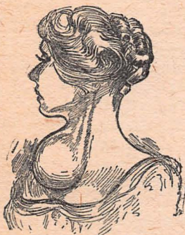
A Cystic Goitre.

Such treatments will not only fail to cure a Goitre, but, in the great majority of cases, the patient is far worse off after the treatment than before. This is