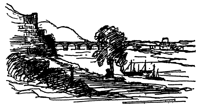
SKETCH OF BRIDGE AT HUY, BELGIUM.