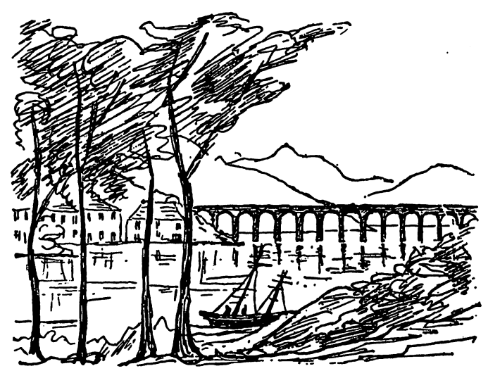
THE PERCIPIENT'S IMPRESSION.