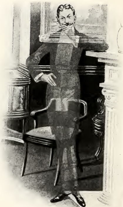
THE GAY GNANI OF GINGALEE