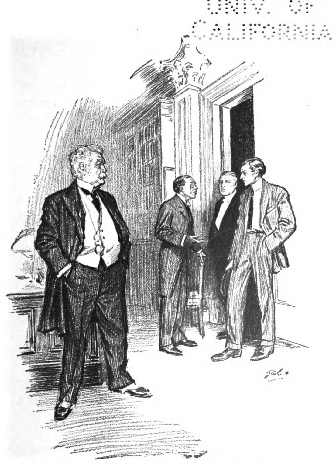
"Fix it?" said the reporter. "Not with me, you can't"