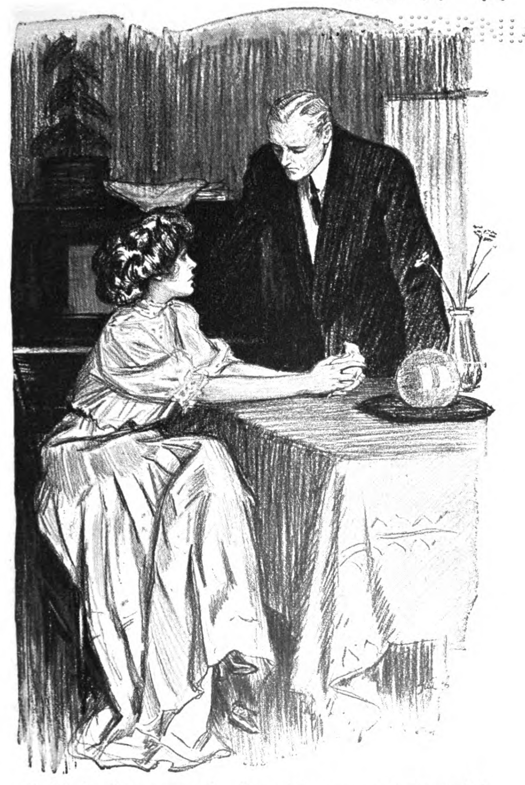
Suddenly they saw each other with a new and wonderful sympathy