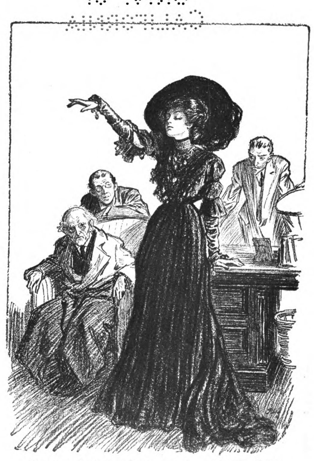
Vera, in a hushed and solemn voice, called for silence