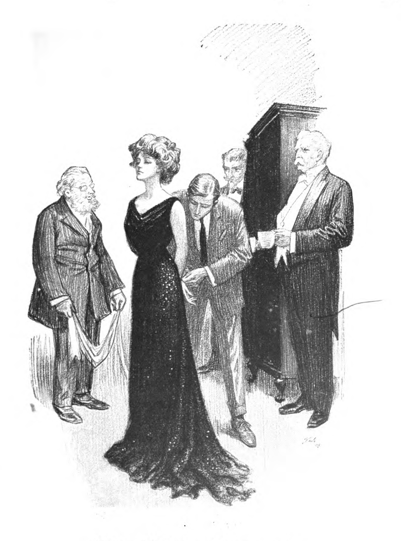
"Tell me if I hurt you," he murmured