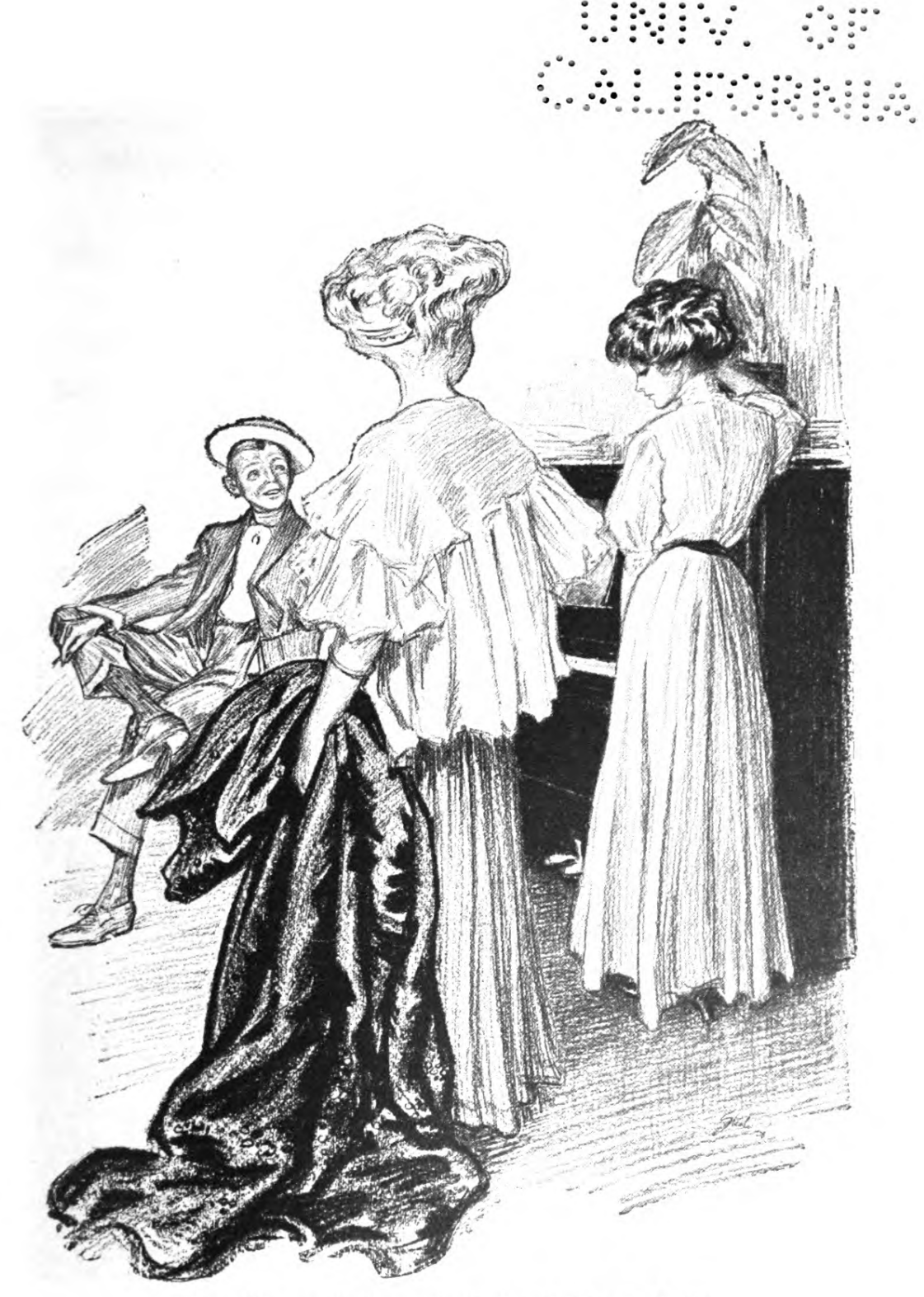
"I will not," she rebelled. "I hate it!"