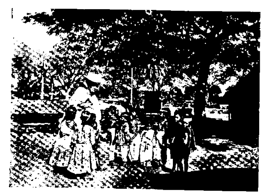
CHITRA AND BROWN BABIES.