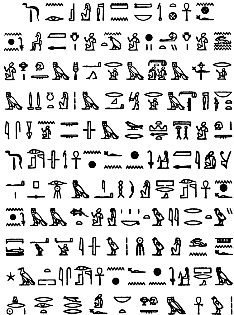
STELE OF ANKH-F-N-KHONSU.