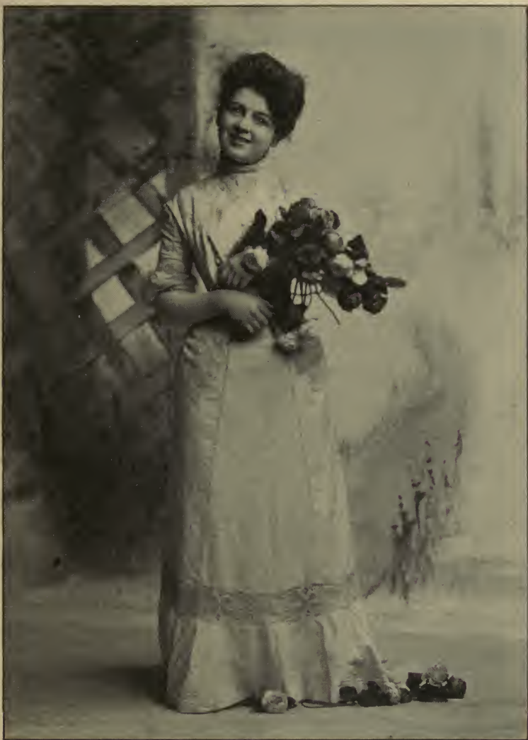
THE ENCHANTED ROAD