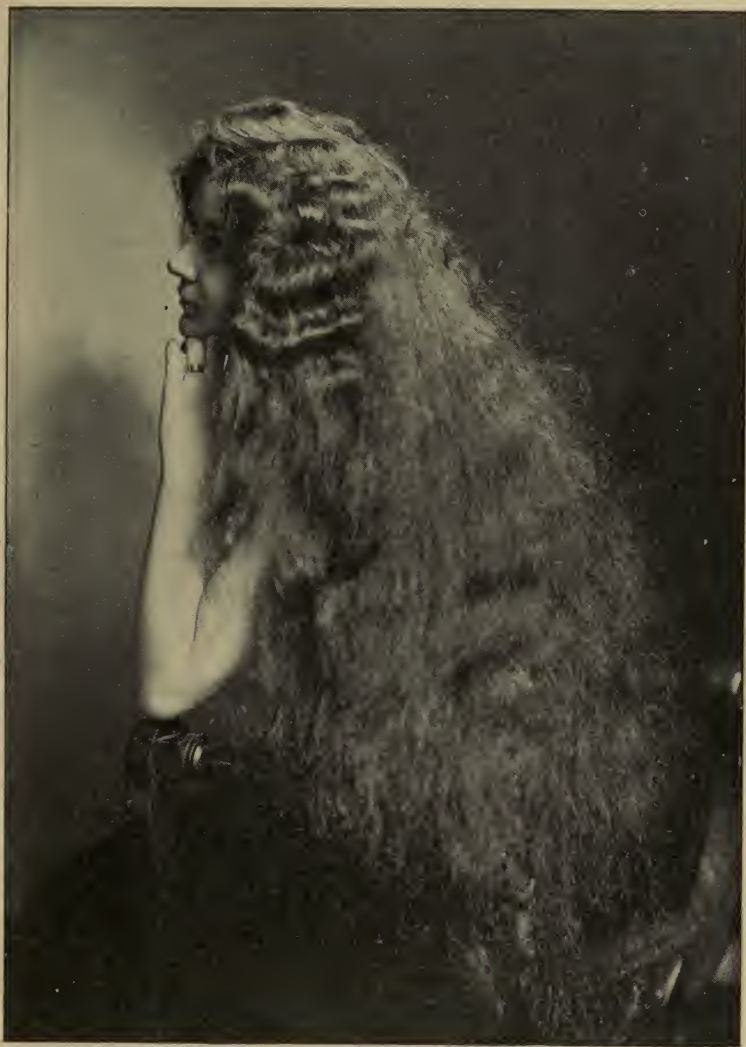
CROWN OF GLORY