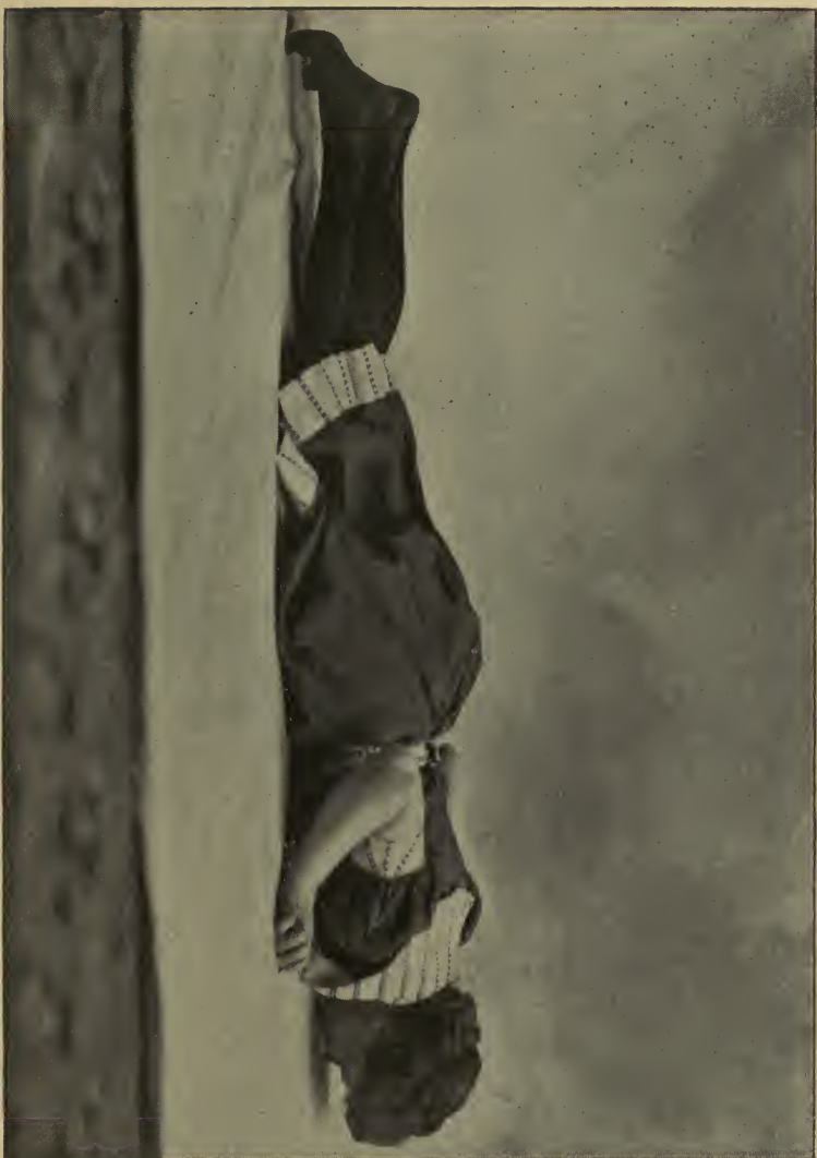
HORIZONTAL CHINNING 2