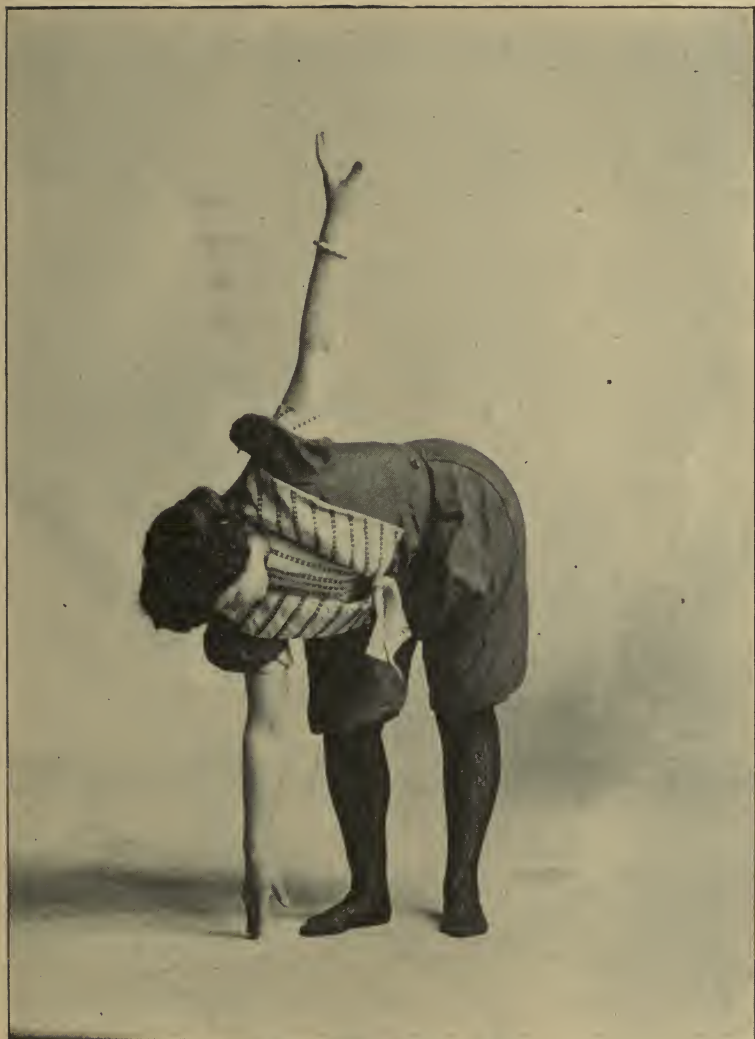
WAIST-LINE EXERCISE 2