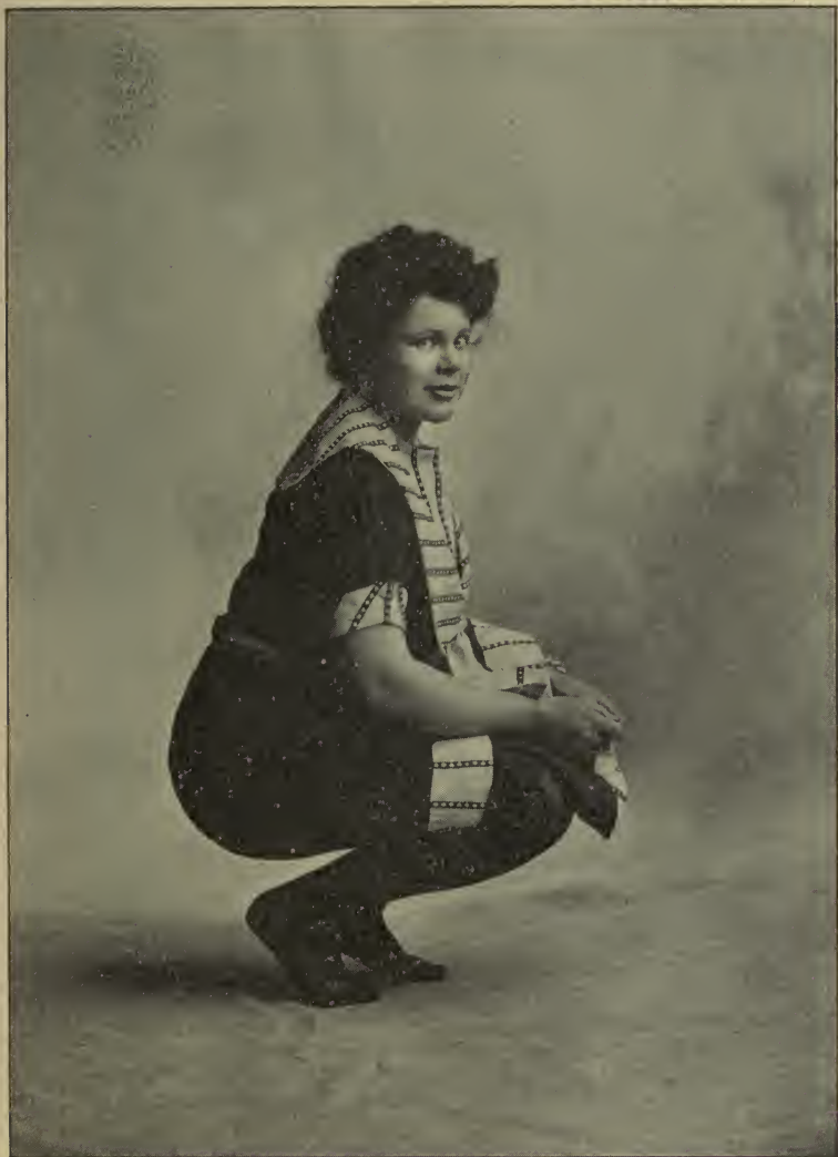
SITTING AND RISING