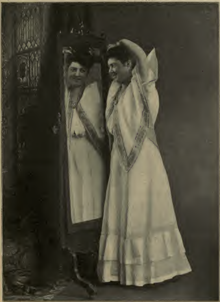
THE MIRROR SMILE