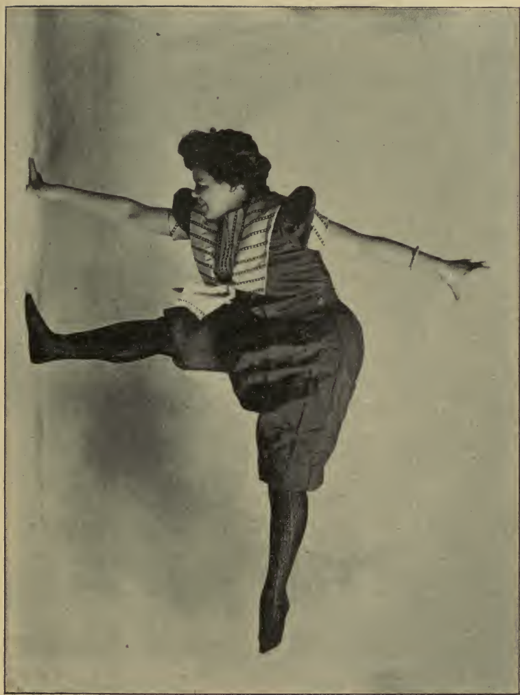
LEG AND BACK DEVELOPMENT