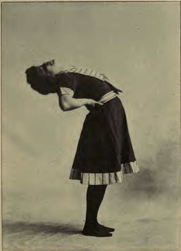
WAIST-LINE EXERCISE 1