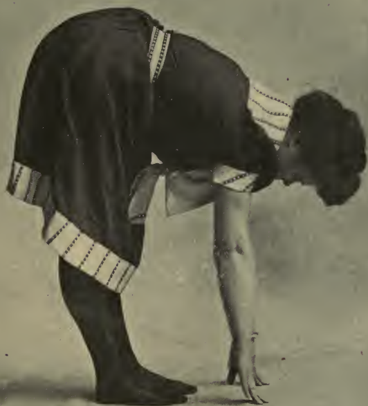
WAIST-LINE EXERCISE 3