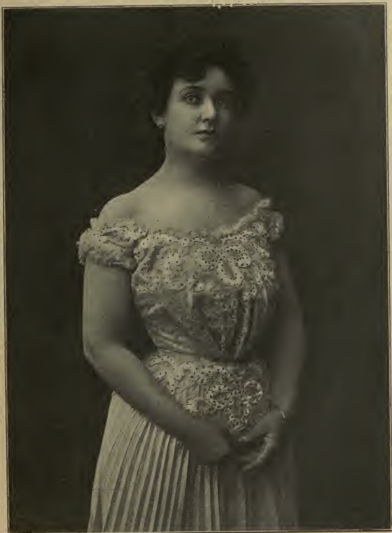
THE FORM SUPERB