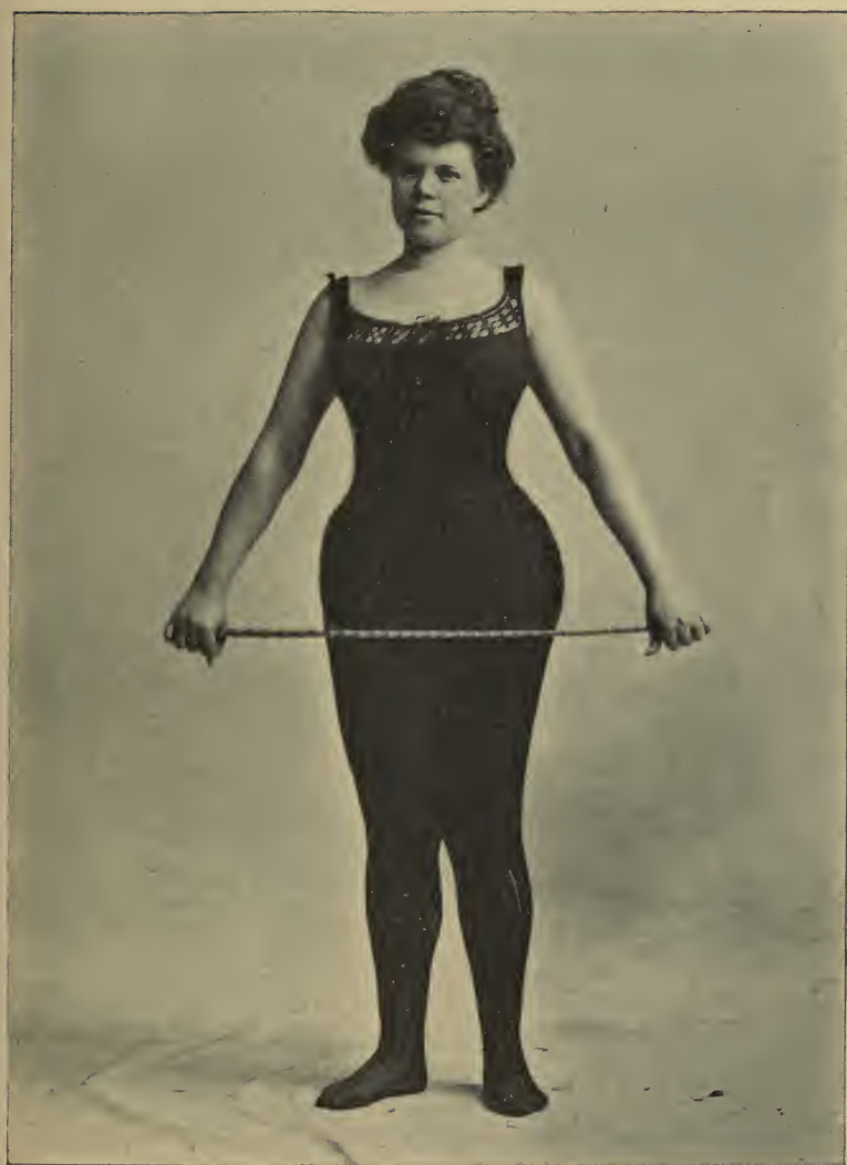
BERNHARDT EXERCISE C1