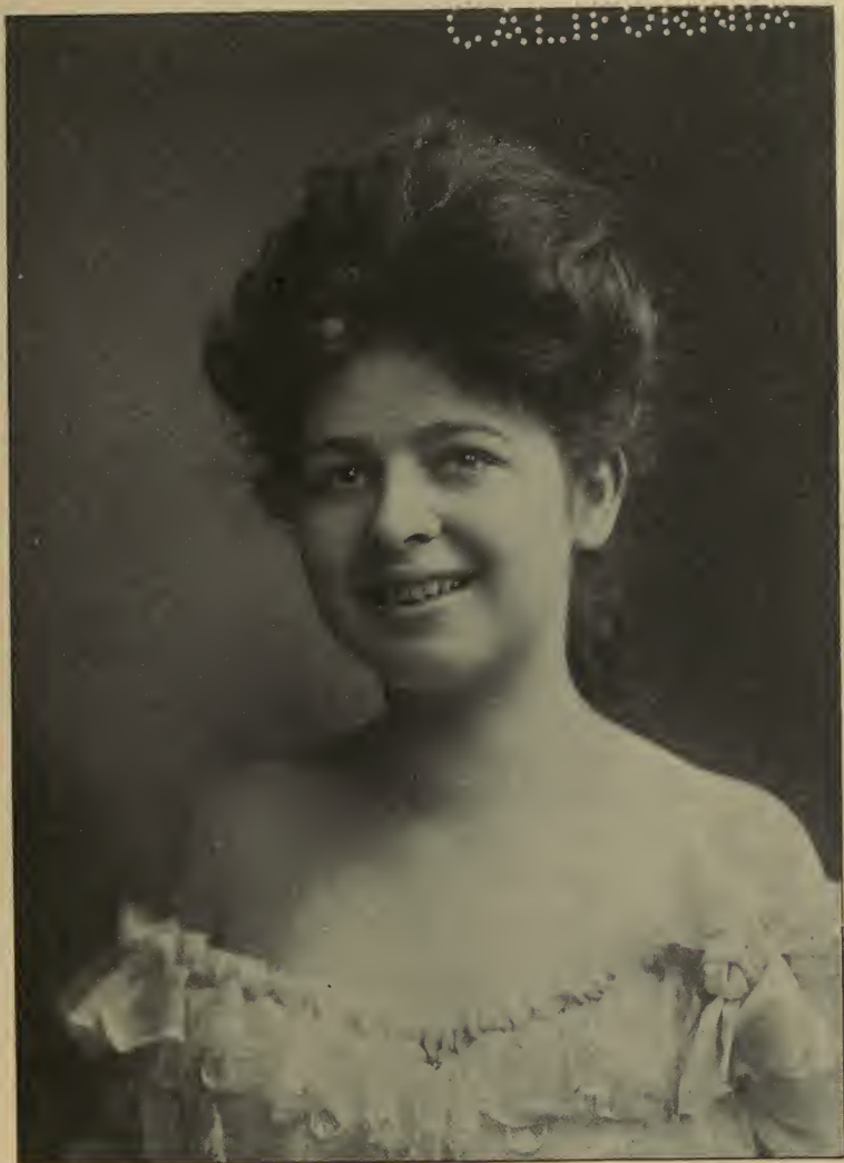
THE IRRESISTIBLE SMILE