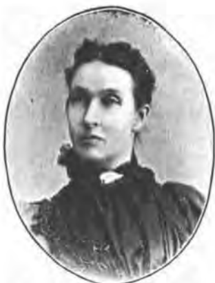
MARY ELIZABETH LEASE.