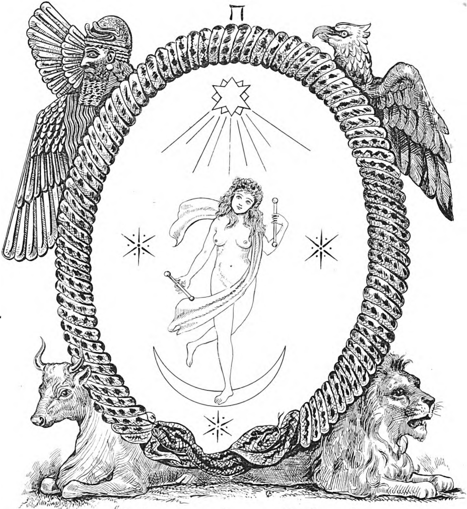
Palnam qui meruit ferat.