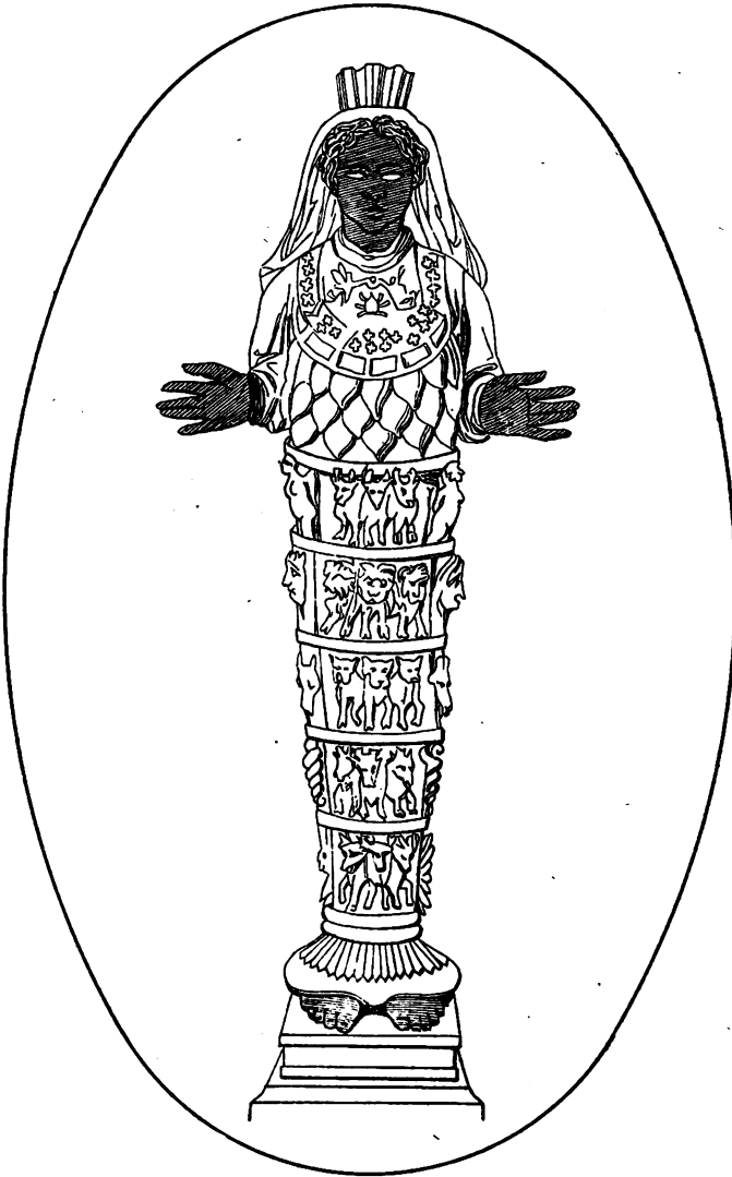
VIRGIN OF THE WORLD. 1885.