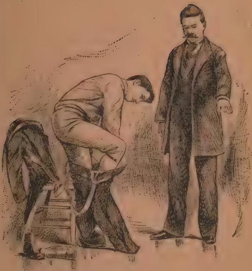
Preparing for a bath in an imaginary stream.