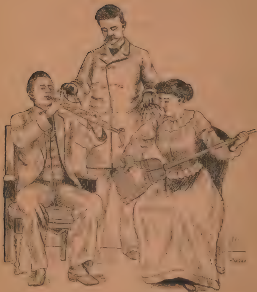
Hypnotized subjects laboring under the hallucination that they are musicians.