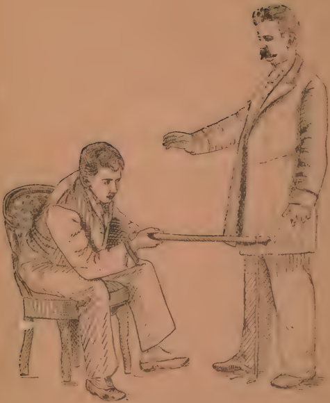
Imagines he is fishing.