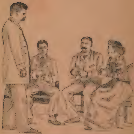
The usual method pursued by traveling mesmerists in giving exhibitions.