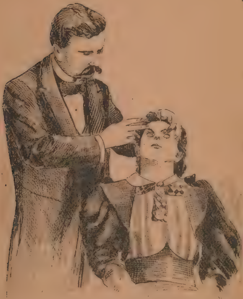
Eyes of a hypnotized subject caused to turn down and completely back in the head. This phenomena is a puzzle to scientific men.