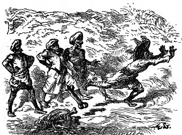
The bone thereupon stood upright, and hopped about.

Then they determined to return home. As with beating hearts they approached the old city, their birth-place, and gazed with moistened eyes upon its tall spires and grim pagodas, its verdant meads and venerable groves, they saw a Kanjar, 1 who, having tied up in a bundle the skin and bones of a tiger which he had found dead, was about to go on his way. Then said the thief to the gambler, "Take we these remains with us, and by means of them prove the truth of our science before the people of Gaur, to the offence of their noses." 2 Being