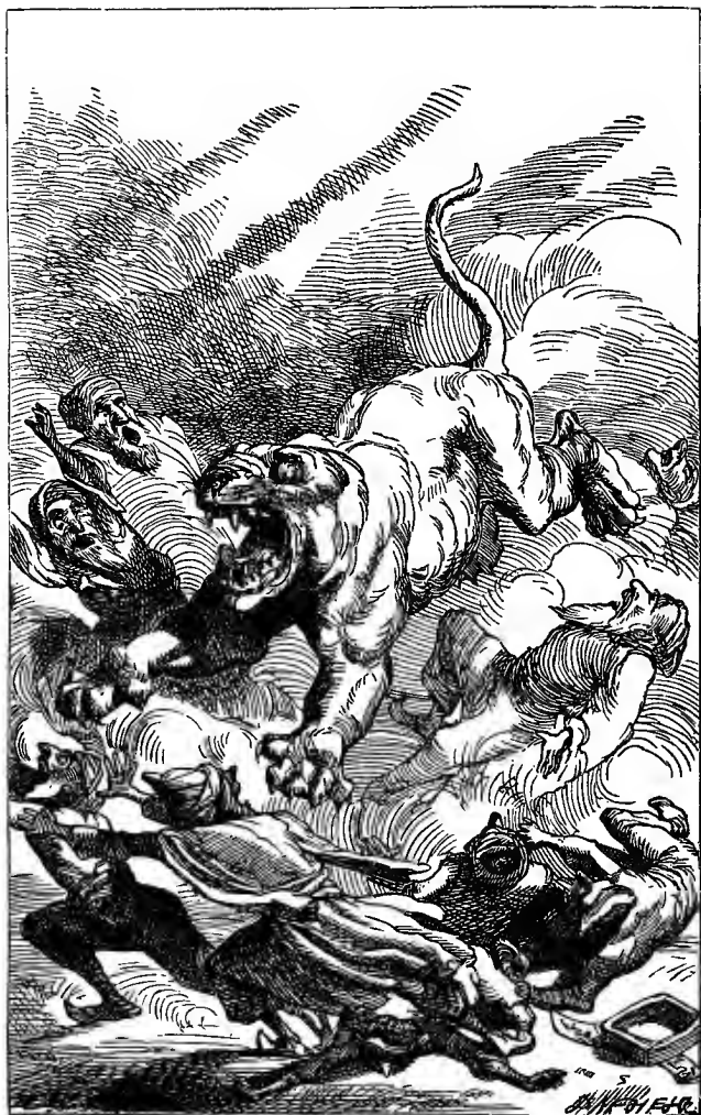
With a roar like thunder ( to face p. 179 ).