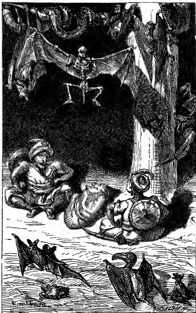
Vikram placed his hundle upon the ground, and seated himself cross-legged before it ( to face p. 158 ).