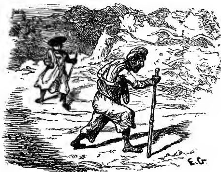
Baman, the second suitor, tied up a bundle and followed

Baman, the second suitor, tied up a bundle of his beloved one's ashes, and followed—somewhat prematurely—the precepts of the great lawgiver Manu. “When the father of a family perceives his muscles becoming flaccid, and his hair grey, and sees the child of his child, let him then take refuge in a forest. Let him take up his conse-