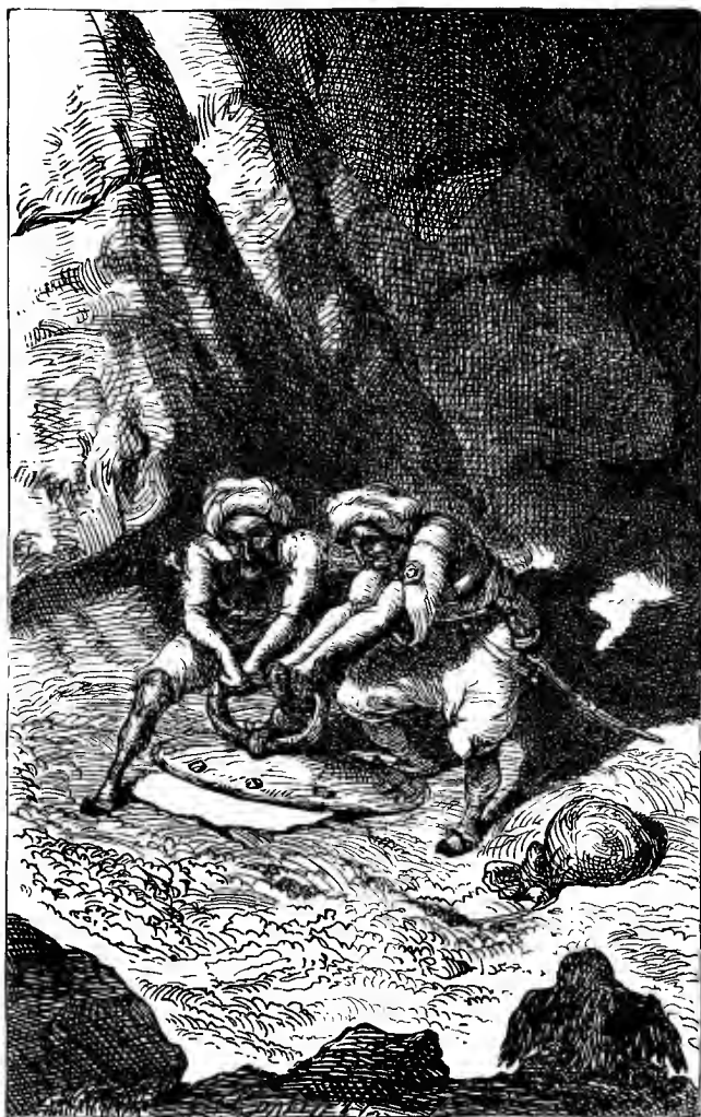
The two then raised, by their united efforts, a heavy trap-door ( to face p. 132 ).