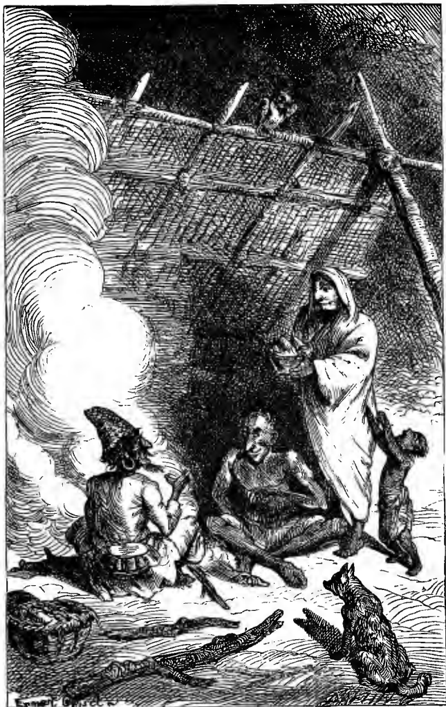
The householder's wife came to serve up the food, rice and split peas ( to face p. 154 ).