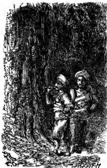
After a few minutes the signal was answered.

After a sharp walk the pair reached a high perpendicular sheet of rock, rising abruptly from a clear space in the jungle, and profusely printed over with vermillion hands. The thief, having walked up to it, and made his obeisance, stooped to the ground, and removed a bunch