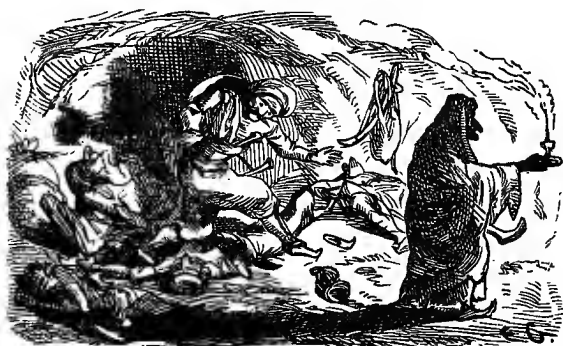
Treading with the foot of a tiger cat.

Then having mentally prepared his measures, the Raja warned a company of archers to hold themselves in readiness for secret service, and as each one of his own people returned from the robbers' cave he had him privily arrested and put to death—because the deceased, it is said, do not, like Baitals, tell tales. About nightfall, when he thought that the thieves, having finished their work of