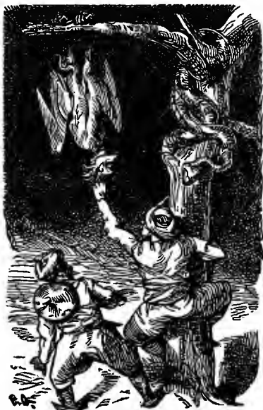
He once more seized the Baital's hair.

"Decidedly this is the young oilman!" exclaimed the Raja, after he had stood for a minute or two with mouth open, gazing upwards and wondering what he should do next. Presently he directed Dharma Dhvaj not to lose an instant in laying hands upon the thing when it next