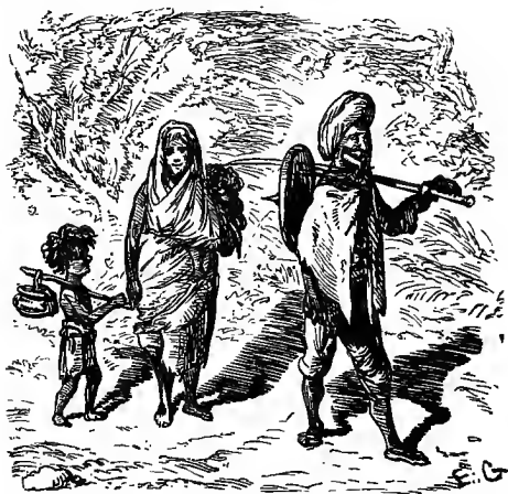
In the meantime a traveller, a Rajput, by name Birbal.

In the meantime a traveller, a Rajput, Birbal by name, hoping to obtain employment, came from the