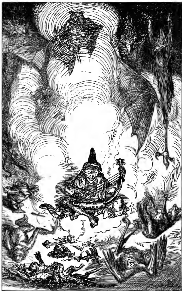
An edifying spectacle, indeed, for the world to see; a cross old man sitting amongst his gallipots and crucibles ( to face page 173 ).