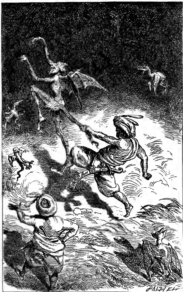
The King, puffing with fury, followed him at the top of his speed, and caught him by his tail ( to face p. 105 ).