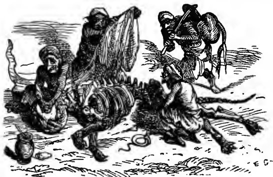
They prepared for their task.

The third drew from his pouch the brain and eyes of