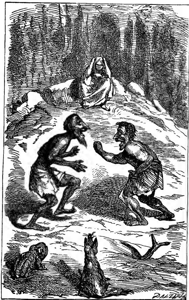
Then a horrid thought flashed across her mind; she perceived her fatal mistake (to face p. 212).