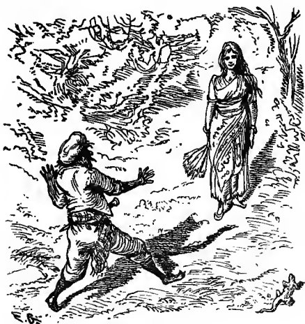
But their eyes had met.

“Nonsense!” exclaimed the warrior king, testily, “I can never believe in that freak of Kama Deva.” He