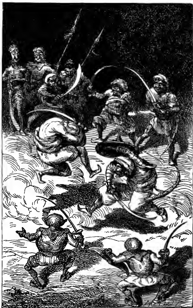
The King was cunning at fence, and so was the thief ( to face p. 136 ).