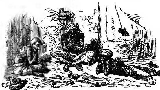
They tried to live without a monthly allowance, and notably they failed.

A month afterwards came the libertine's turn to be disappointed. He could no longer afford fine new clothes; even a well-washed coat was beyond his means. He had