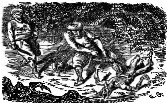
Presently the Demon was trussed up as usual.

Then it struck him as being passing strange that she had begun to love him when the last sand of his life was well nigh run out; that wondrous are the ways of the revolving heavens which bestow wealth upon the niggard that cannot use it, wisdom upon the bad man who will misuse it, a beautiful wife upon the fool who cannot protect her, and fertilizing showers upon the stony hills. And thinking over these things, the gallant and beautiful thief laughed aloud.