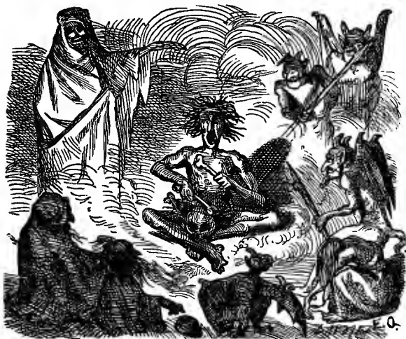
He was playing upon a human skull with two shank bones.

For a moment he thought of the giant's words, "And remember that it is lawful and right to strike off his head