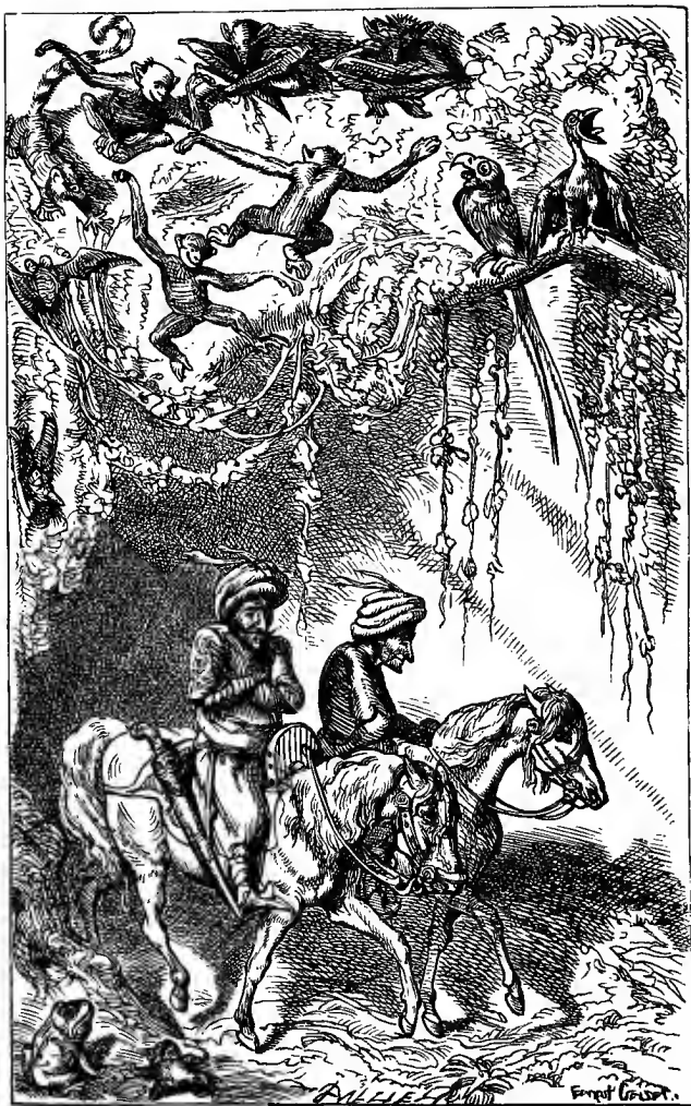
During the three hours of return hardly a word passed between the pair ( to face p. 45 ).