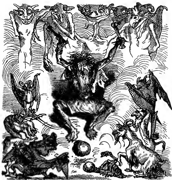
There he found the Jogi.

farewell to the warrior king and to his son. He complimented the former for the last time, in his own way, upon the royal humility and the prodigious self-mortification which he had displayed—qualities, he remarked, which never failed to ensure the proprietor's success in all the worlds.