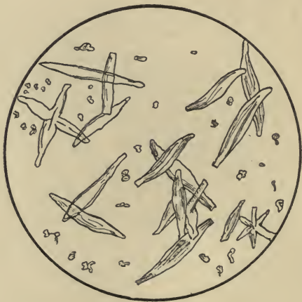
'Fig. 548.—CRYSTALS FROM SPERMATIC FLUID.

line, and it contains 82 per cent. of water, serum-albumin, alkali-albuminate, nuclein, lecithin, cholesterol, fats (protamin?), phosphorized fat, salts (2 per cent.), especially phosphates of the alkalies and earths, together with sulphates, carbonates, and chlorides. The odorous body, whose nature is unknown, was called ' spermatin ' by Vauquelin.