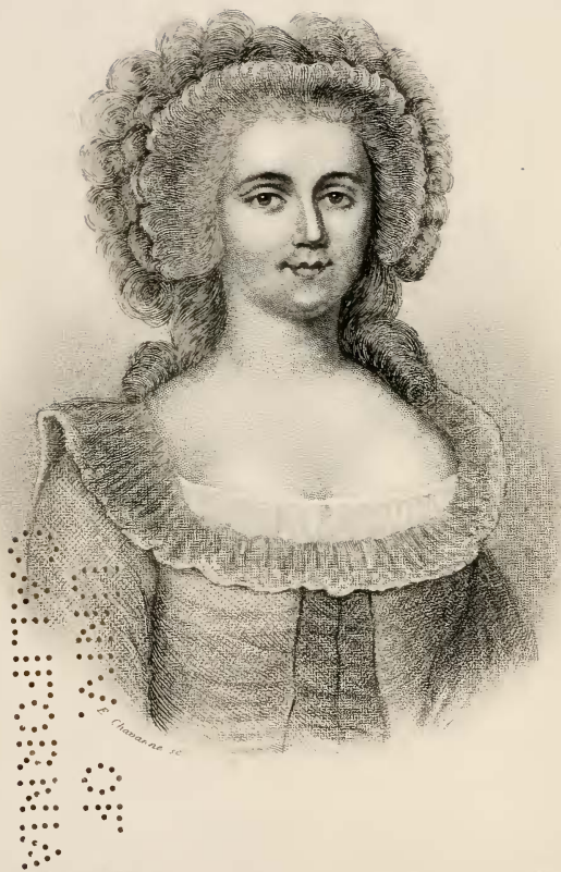
The Countess de la Motte

From the Portrait after Robinet, prefixed to the Life of the Countess de la Motte by herself.