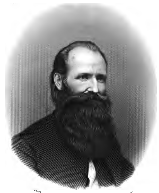
by Thos Sherrall offer a Photograph by landed Detroit