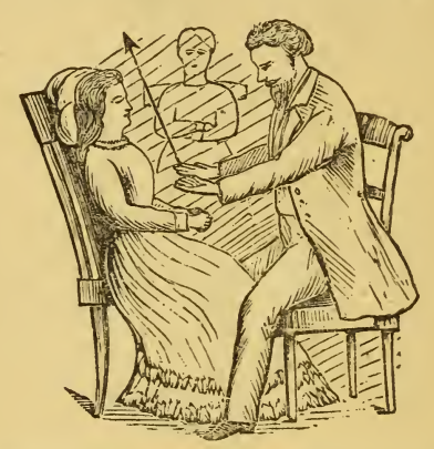
Demesmerizing .- Hands move in direction of dotted lines, briskly.

Should the subject be entirely asleep and you wish to waken him, you can let him alone and he will wake of his own accord in a few hours, but this is not advisable by any means. If you tell him to "Wake up now," in a firm tone, he will do so in a minute or two, when you will use the dispersive passes as already given. Another way still is to use the dispersive passes across the chest and stomach by putting the backs of your hands tog ther and spreading them quickly, as has already been shown, following up with demesmerizing passes across the face and over the head, and finishing by clapping the hands.