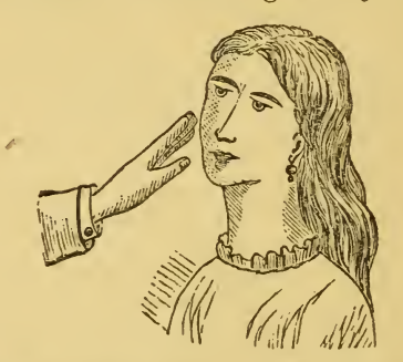
Method of Curing Toothache, Neuralgia, or Headache.

to the crown of the head, as if demesmerizing. This is done by the operator walking around the patient so as to affect every portion of the head, finishing each pass as if drawing some deleterious influence from the patient's head. Some cases can be cured by making downward instead of upward passes. Frequently the patient will be relieved by breathing on his head a few times after you have commenced the passes. Should the disease not yield to this treatment (which is to be used while the patient is awake), then put the patient to sleep and follow the foregoing directions the same as when he was awake. Neuralgia, when severe, is best treated by the complete mesmerizing of the patient, and as soon as the sleep is produced let local passes, without contact, be made over the part affected Mild cases can usually be relieved by a few general passes, as in mesmerizing a subject, followed by