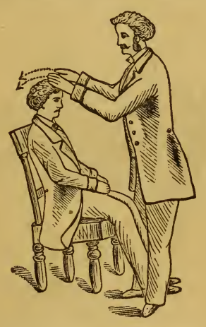
Demesmerizing .- Hands move in direction of dotted lines, briskly.

Dispersive passes are the reverse of the mesmeric manipulations already described. Place your hands directly in front of the subject's face, with the backs together; then spread them apart quickly as if brushing something off his face—also throwing your hands over his head as if brushing his hair back with the palms. Continue these