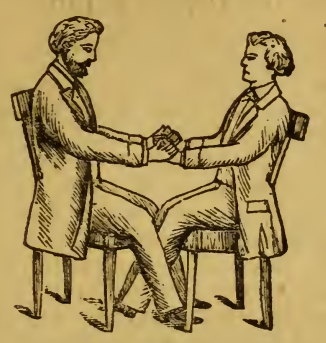
Position when Mesmerizing.

casy position in a chair or on a sofa, so that a muscle need scarcely be moved during the entire sixting. Everything