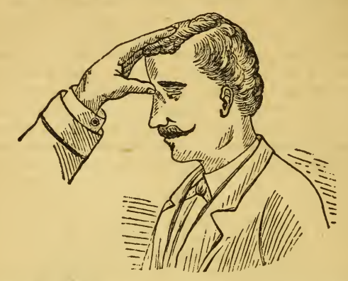
Thumb on Individuality.—Taking the Communication.

veniently lengthen the pass until you reach the feet of the subject. Make several of these long passes and then follow with other passes, commencing at the head as before