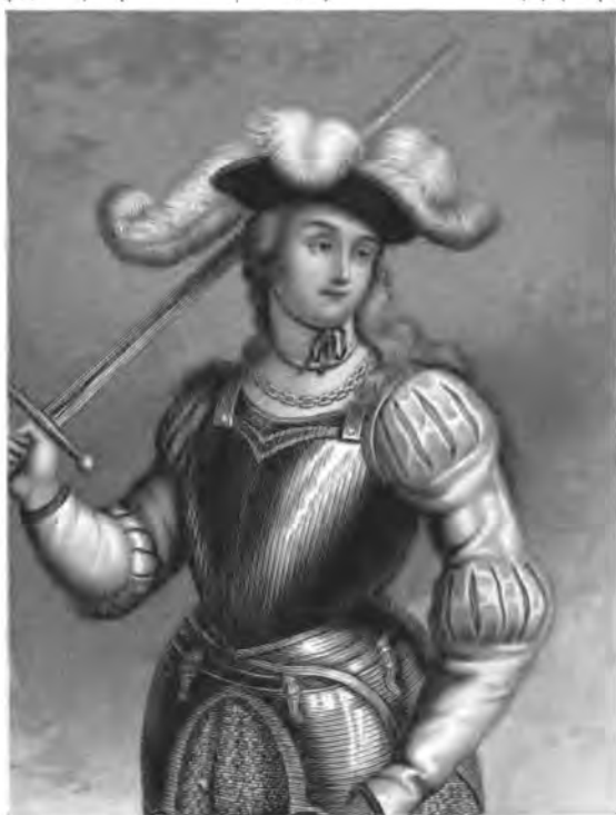
Jean of Arc