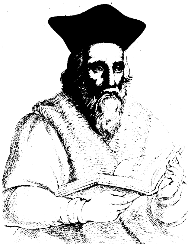
R Cooper sculp t