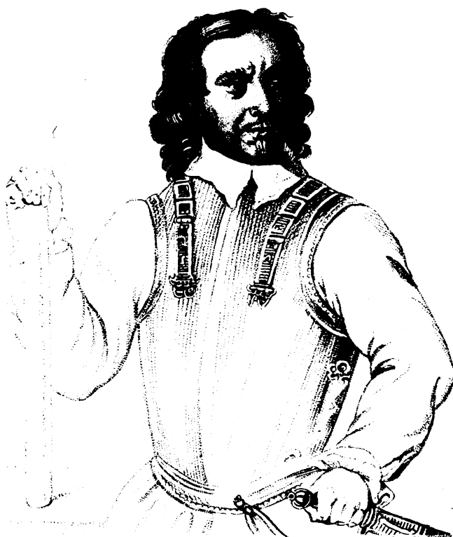
A Cooper sculp