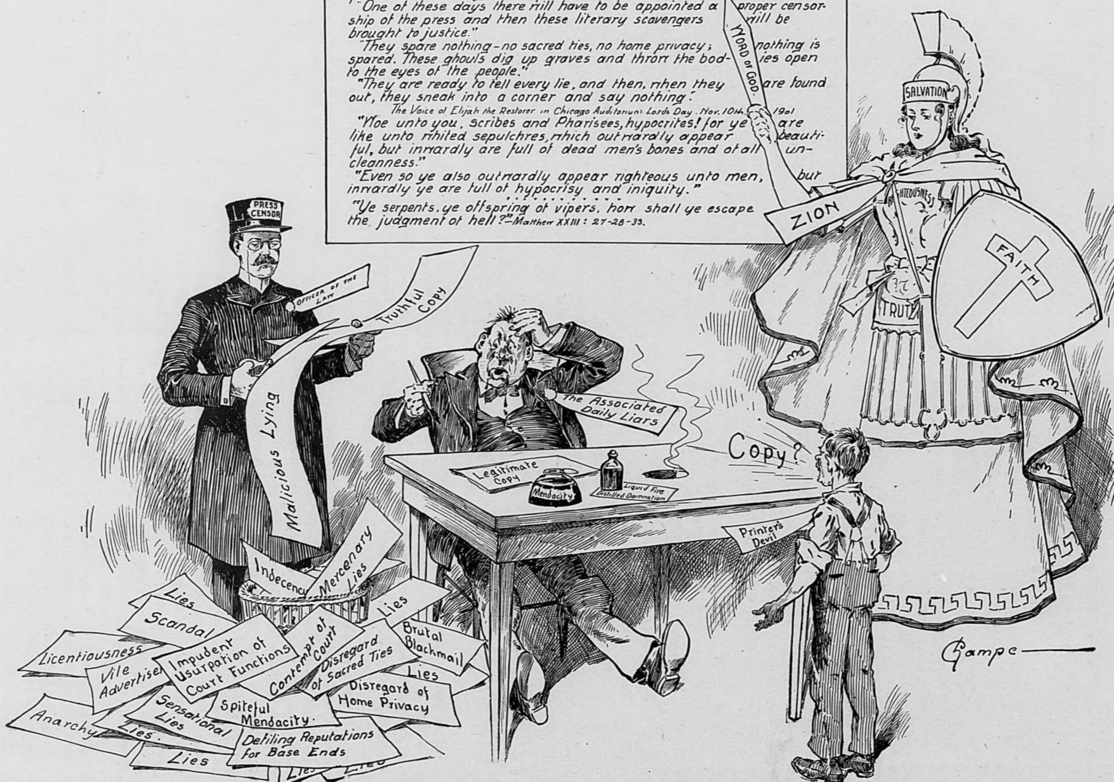
WHAT MUST BE DONE—THE CENSORSHIP OF AN UNBRIDLED LICENTIOUS PRESS.

"The press as it is now is a vile institution." "One of these days the Legislative powers of each State, and of the Nation itself will have to take up this question of a brutal, licentious, and utterly Anarchistic press, that has no hesitation whatever in defiling any man's name against whom it has a spite." "It does not matter whether it is Democratic or Republican, any vile fellow who can sling ink is permitted to defile the fairest reputation." "One of these days there will have to be appointed a proper censorship of the press and then these literary scavengers will be brought to justice." "They spare nothing - no sacred lies, no home privacy; nothing is spared. These ghouls dig up graves and thrust the bodies open to the eyes of the people." "They are ready to tell every lie, and then, when they are found out, they sneak into a corner and say nothing." The Voice of Elijah the Restorer in Chicago Auditorium, Lord's Day, Nov. 10th, 1901 "Nay unto you, scribes and Pharisees, hypocrites! for ye are like unto whited sepulchres, which outwardly appear beautiful, but inwardly are full of dead men's bones and of all uncleanness." "Even so ye also outwardly appear righteous unto men, but inwardly ye are full of hypocrisy and iniquity." "Ye serpents, ye offspring of vipers, how shall ye escape the judgment of hell?" - Matthew XXIII : 27-28-33.