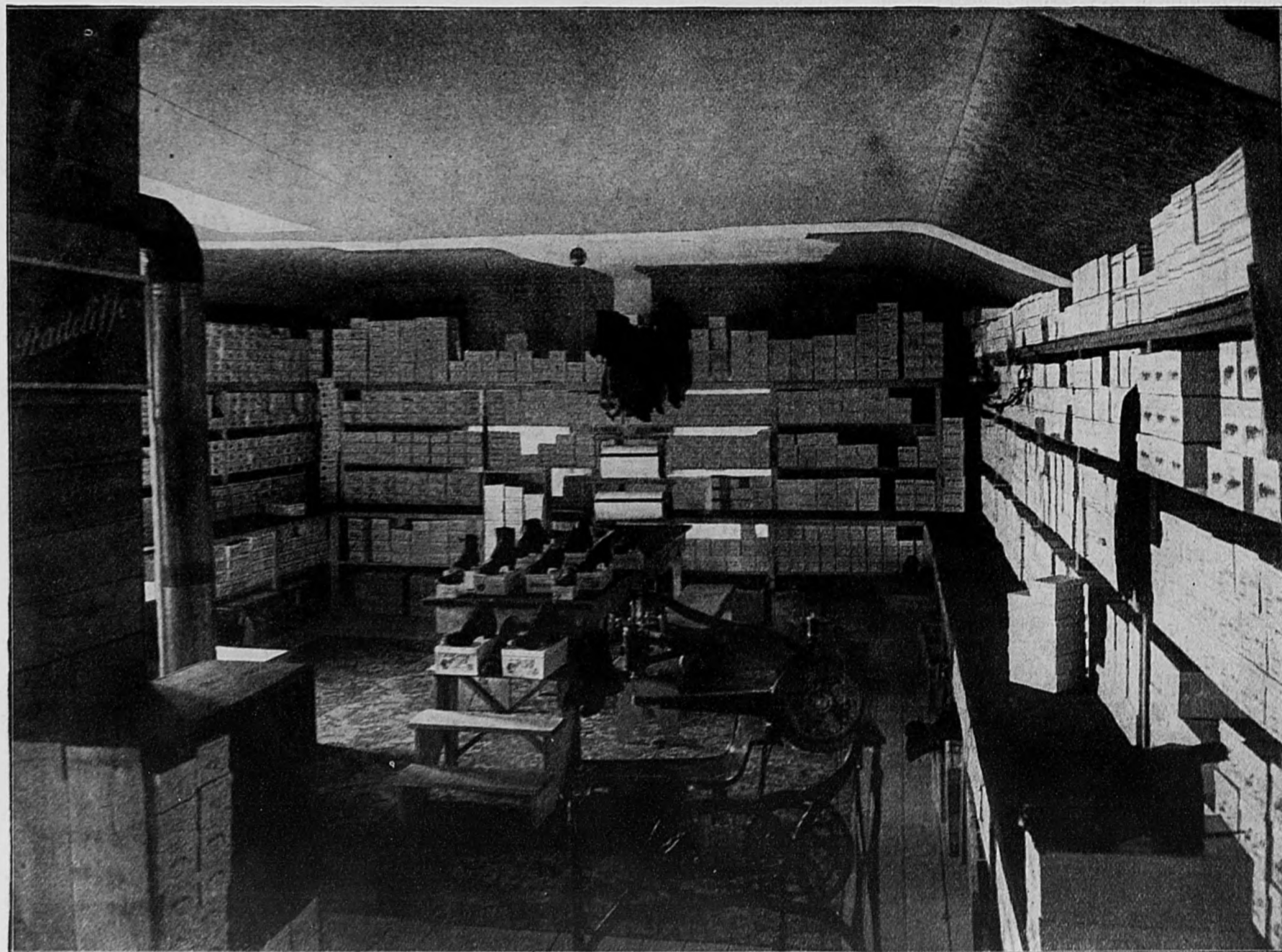
SHOE DEPARTMENT, ZION CITY GENERAL STORES. February 19, 1902.

Bricklayers are rapidly pushing up the walls of the mending and drafting room at the north end of the buildings, and of the middle section of the main factory building yet uncompleted. There is very little to do on either one of these portions,