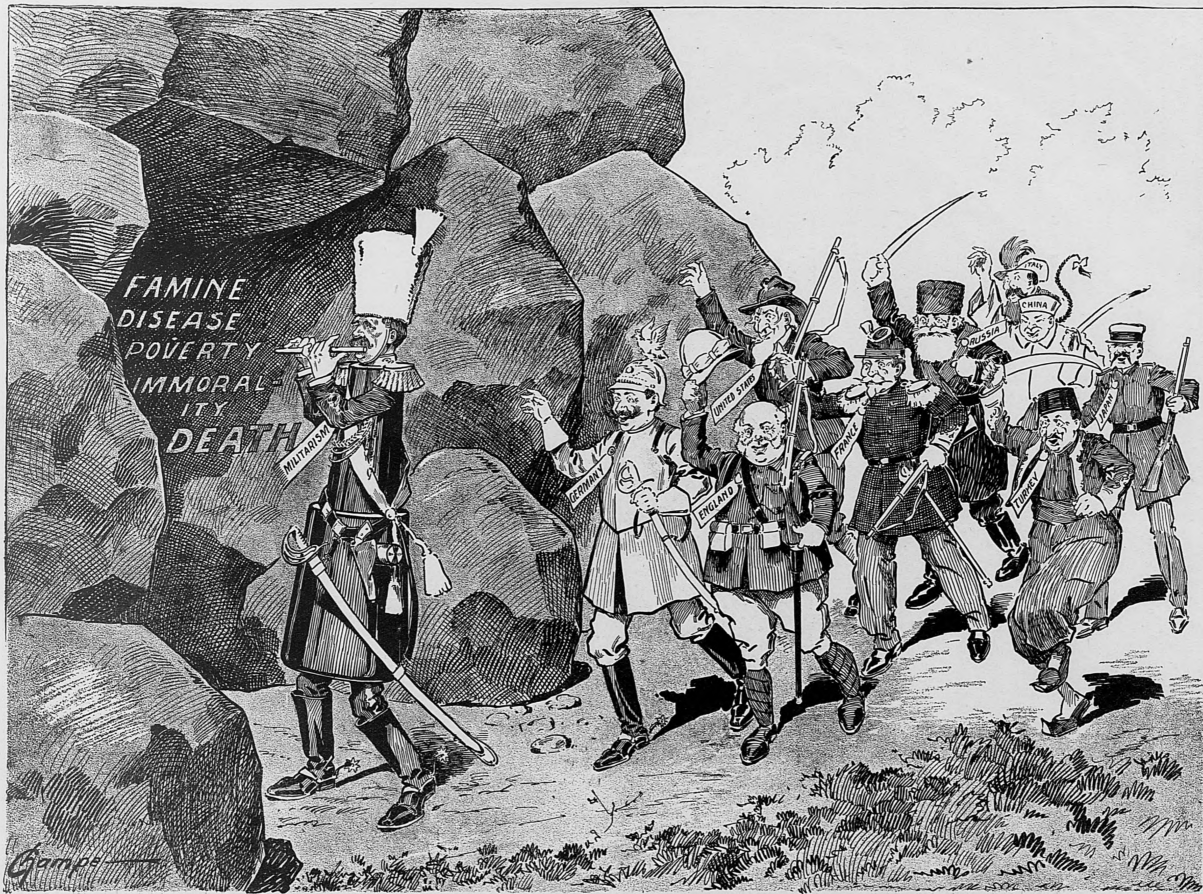
THE MILITARY "PIED PIPER."