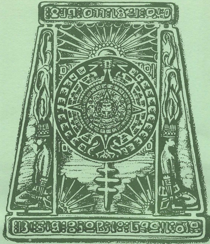
OFFICIAL EMBLEM OF