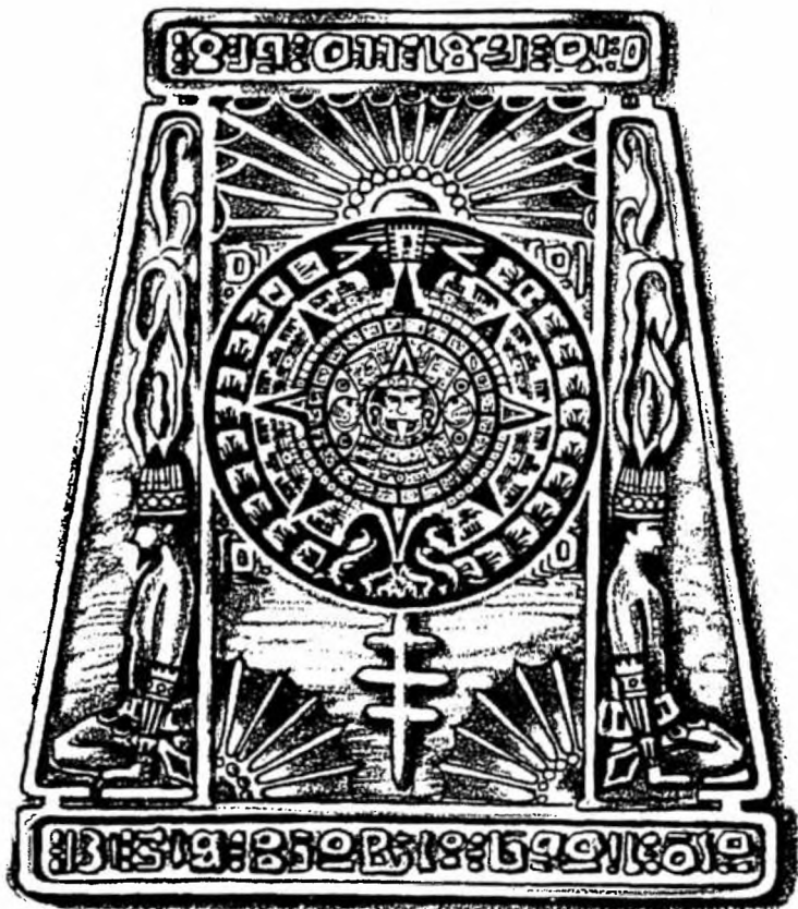
OFFICIAL EMBLEM OF