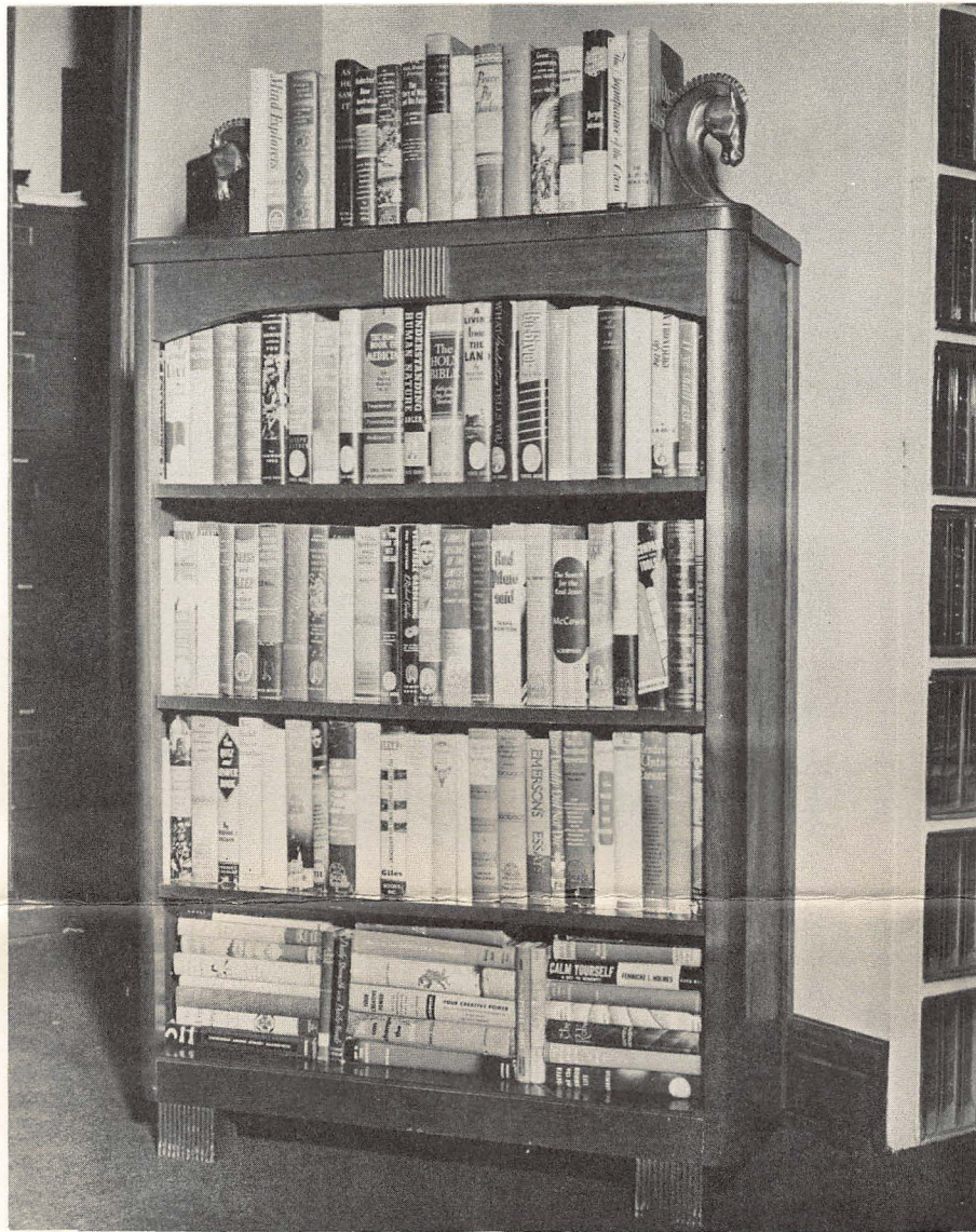
PHOTOGRAPH OF GREAT BOOKS IN THE MAYAN LIBRARY