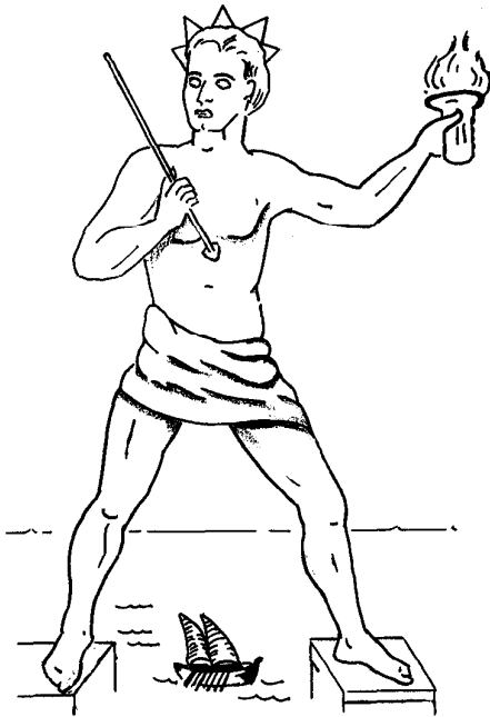
Reconstruction of one of the 7 Wonders of the Ancient World The Colossus of Rhodes

We have read of the eminent sculptor, Gutzon Borglum, who carved mountains into gigantic statues. That task, enormous as it is, fades into insignificance beside the work of building the Colossus of Rhodes, a statue of the sun god so gigantic that it is said ships sailed between its legs, which spanned the harbor; a statue of bronze built on a tiny island in the Mediterranean Sea two hundred years before Christ was born. Imagine the furor such a structure would create if built today. Try to imagine how men of that day accomplished it without modern machinery, without modern engineering and using only the crudest of tools. They believed it could be done. They did it.