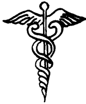
U. S. Army Caduceus

emblem of entwined serpents about a rod. The rod represents man; the circle at the top represents the Sun (the emblem of God); and the serpents, two schools of wisdom - one is the means of healing through the Mind; the other, healing through medicine and surgery. The winged caduceus, or herald's staff, was in Greek Mythology, the wand of Mercury who was the messenger of the Gods. The name caduceus is derived from the Greek, kerykeion. In the Maya country and in Egypt, the spread wings represented the rays of the sun, the blessings of God