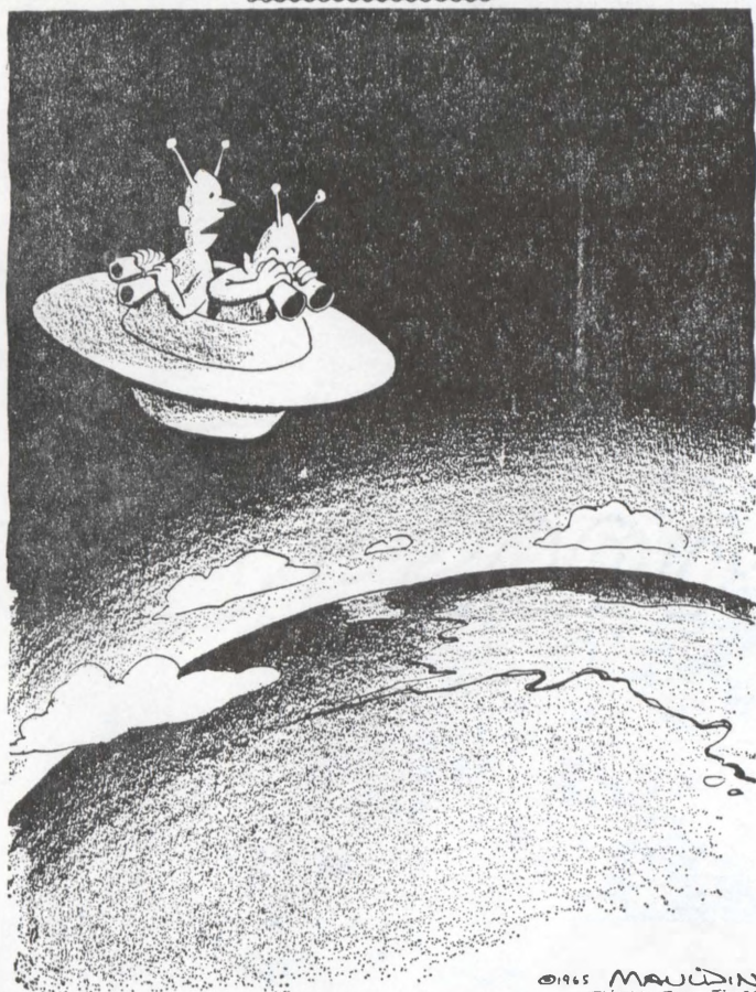
'A Planet Three-Quarters Covered With Water Couldn't Possibly Support Life'

Last night other observers reported seeing an object move across the sky around 10 p.m. GREENER & JOURNAL HENDERSON, KY.