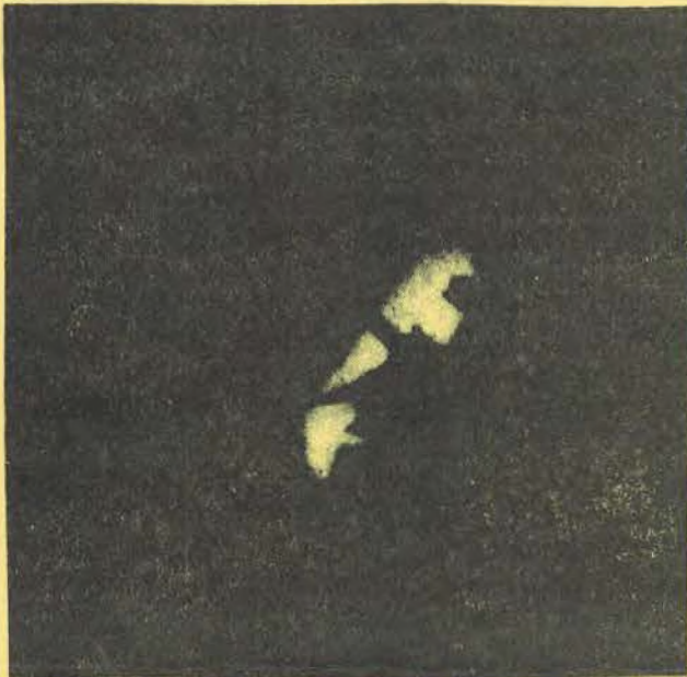
UFO

A witness who disappeared for one week; an attempted abduction; an apparent abduction; loss of memory; occupants; a ball of light that landed on a car; a UFO that shook an automobile; an object that descended upon a car; another that paced an automobile; UFOs that caused electro-magnetic (E-M) and physiological effects, animal reactions, emitted sounds and an odor; a UFO that emitted smaller objects; objects that landed, left behind physical evidence and frightened witnesses; a UFO that hovered near power lines; an object that was photographed; and clouds that parted to let a UFO pass were characteristics of sighting reports from at least four states and six foreign countries during the period June-November, 1979.