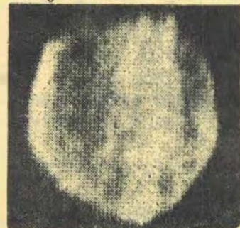
UFO Film, Kaikoura, South Island, New Zealand, December 30, 1978.

"Air traffic control then told us there was an object about one mile behind us and I turned the aircraft around to have a look," he stated. "We spotted something which kept accelerating to get closer to us and would then fall back. I know of no aircraft which could carry out such a maneuver."