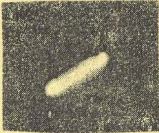
UFO photograph, near Farmington, Minn., September 22, 1975

also saw the objects. Meanwhile, law enforcement officers from Egan, Lakeville, Rosemount, and two state troopers joined the witnesses. All watched "as the bottom object moved slowly around." The UFOs, "beginning to depart," were joined by an orange-white object, "shaped like the head of a bullet," that streaked from the southwest to the northeast. As the UFO "passed by the other objects, they all disappeared."