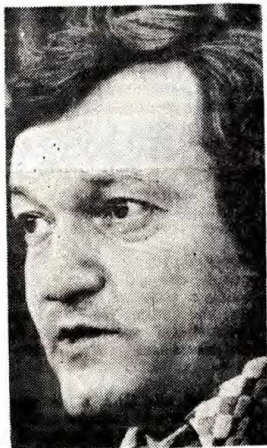
Erich Von Daniken

"Only later does the scientific community start to work with the parts of the amateur's theory," he remarked. "The scientific community must examine (my) theory. My books are still in the state of theory, but, once it is proved, it is no longer theory. Science should always try to come as close as possible to the truth."