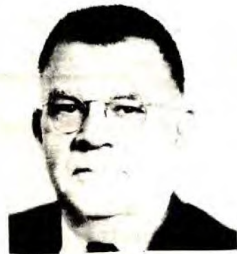
Dr. Edward U. Condon

Though Condon had led a distinguished career as an atomic physicist, including helping to develop the Atomic bomb as a member of the Manhattan Project, being a former director of the National Bureau of Standards, and president of both the American Association for the Advancement of Science and the American Physical Society, he is probably best known to the public as director of the Air Force (AF)-sponsored UFO Project. It was Condon's "conclusions and recommendations" section in the first six pages of the mammoth 965-page (Bantam edition) Project report, Scientific Study of Unidentified Flying Objects , that was accepted by both the press and the public as the official denunciation of the subject, though the rest of the report contained abundant evidence to the contrary.