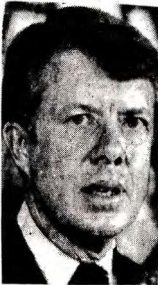
Georgia Governor Jimmy Carter

"I don't laugh at people any more when they say they've seen UFOs because I've seen one myself," stated Georgia Gov. Jimmy Carter.