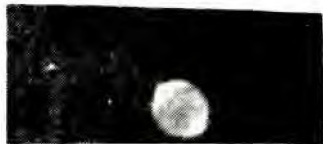
Photograph of a UFO taken near Jeanette, Pa., July 18, 1973.