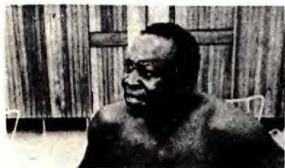
President Idi Amin, of Uganda

President Idi Amin, of the African nation of Uganda, saw a UFO that splashed down into Lake Victoria, then took off, stirring up the water, according to a recent UPI wire story. Radio Uganda reported the alleged incident, adding that Amin believed the object to be a "good omen" for his country.