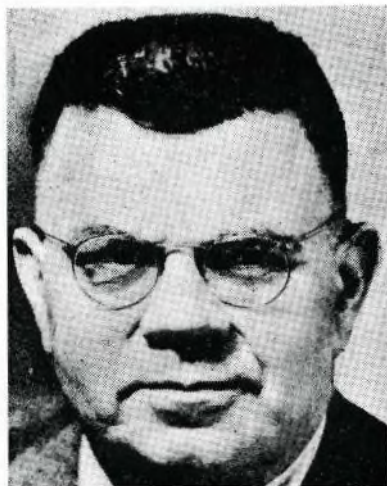
Dr. Edward U. Condon, Head of the University of Colorado UFO Study.