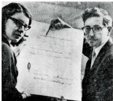
Miss Jocelyn Bell and Dr. Anthony Hewish examine chart of the space signals. Miss Bell, of the Mullard Radio Astronomy Observatory, Cambridge University, England, was the first to notice the strangely regular pattern of the signals from space.