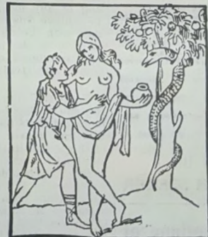
[Heathen Illustration of the Temptation.]

The Bundehesh (a sacred book of the Persians), states that Ahuramazda after creating the first man and woman, Mashya and Mashyana, bade them "to be humble of heart; to observe the law; to be pure in their thoughts, pure in their speech, pure in their actions." But an evil demon came to them in the form of a Serpent , sent by Ahriman, the prince of devils, and gave them fruit of a wonderful tree, which imparted immortality. Evil inclinations then entered their hearts, and all their moral excellence was destroyed. Consequently they fell, and forfeited the eternal happiness for which they were destined. They killed beasts, and clothed themselves in their skins.