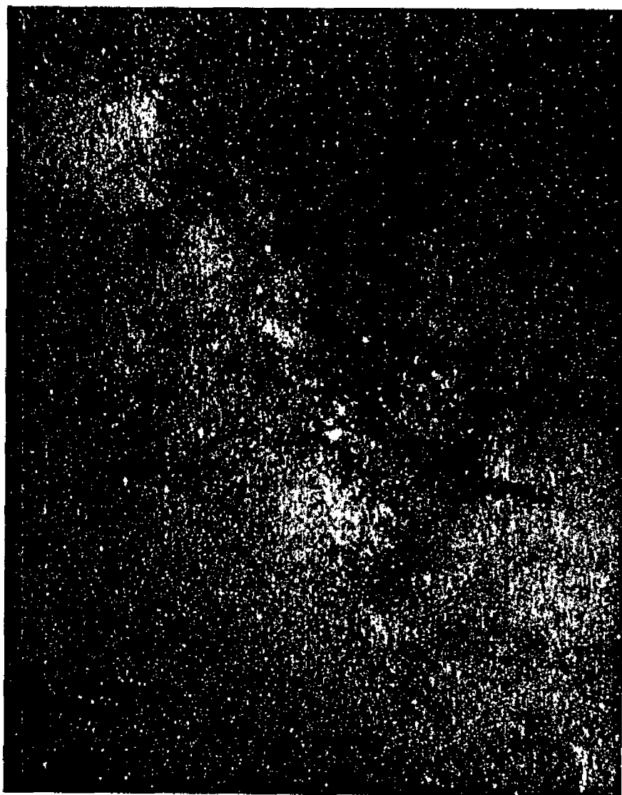
G 80, Star Clouds in Sagittarius , exposure 3\frac{3}{4} hours, July 21, 1922, Tessar Lens.