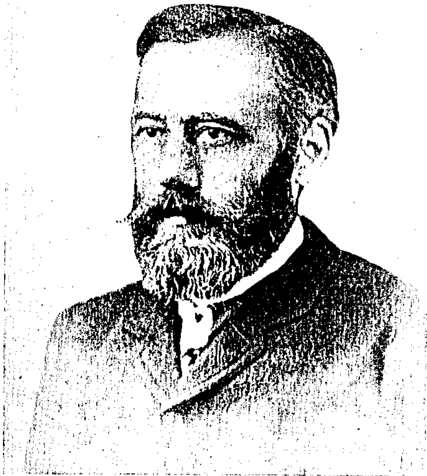
WILLIAM QUAN JUDGE

Co-Founder of the Theosophical Society and its second Leader