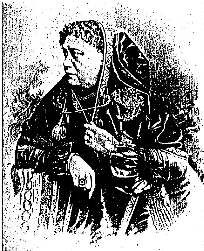
HELENA PETROVNA BLAVATSKY Aug. 11, 1831 — May 8, 1891

Occultism is not the acquirement of powers, whether psychic or intellectual, though both are its servants. Neither is Occultism the pursuit of happiness as men understand the word, for the first step is sacrifice, the second, renunciation.