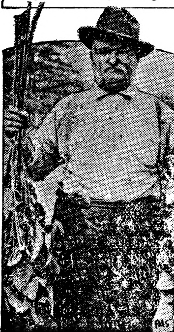
Soy Beans Defy Drought

DES MOINES, Ia. . . . The "hard times" crop for the drought-stricken middle-west has been found. . . . It is soy beans, according to Federal and state agricultural authorities. . . . Soy bean crops are now looked to by farmers to help keep the season from being a total loss. The soy bean's long roots reach deep into subsoil for moisture.