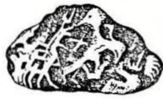
Spirit writing?—Fossils and odd mineral forms were once believed to have been created by underground spirits. Above drawings, from Kircher's Mundus Subterraneus , 1664, were supposed to be true representations of specimens actually found.