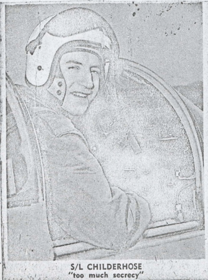
S/L CHILDERHOSE "too much secrecy"

On Feb. 23, 1904, off San Francisco, the crew of the U.S.S. Supply watched a formation of bright discs fly by in line then switch to an