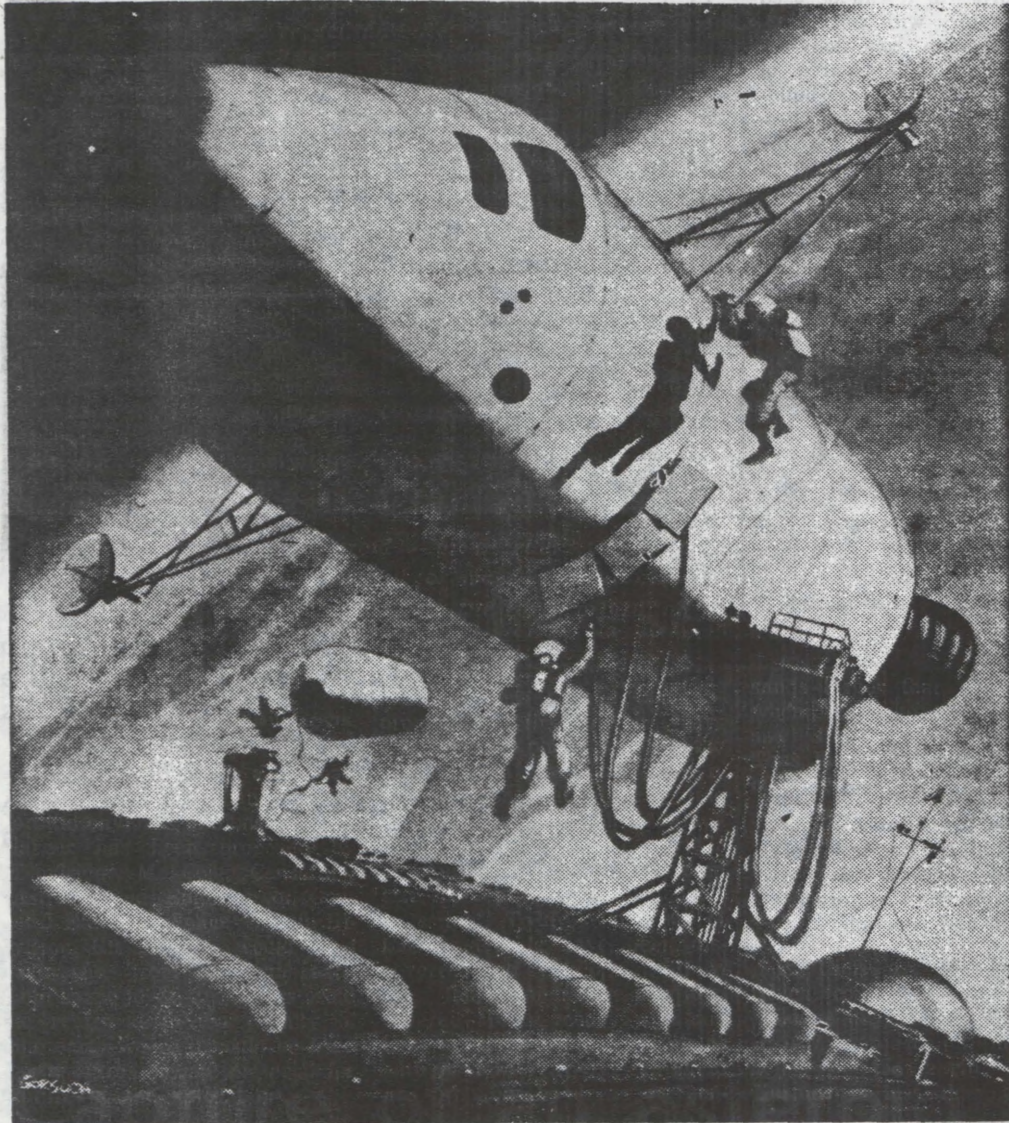
An asteroid — an excellent would-be source of raw material for space explorations — is shown here moved into the earth orbit, and in use as a refuelling base.