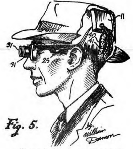
Fig. 5. Transistorized version.