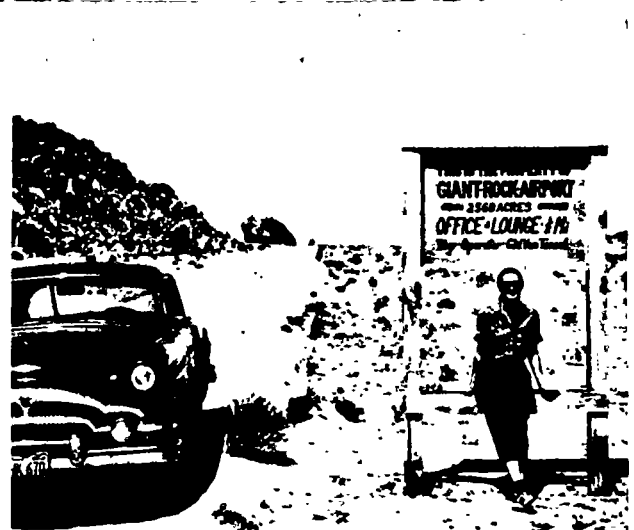
2. Gateway to Giant Rock Airport.