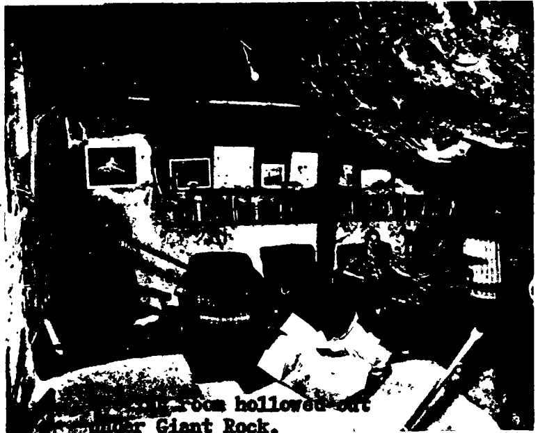
4. Room hollowed out under Giant Rock.