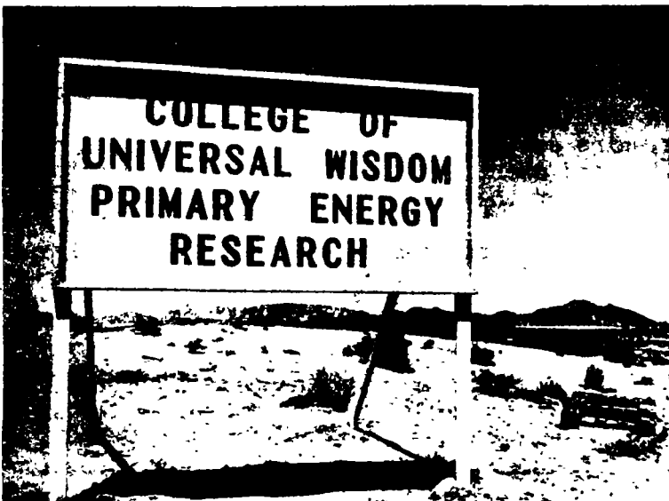
5. Wisdoms College of Universal Wisdom Building.