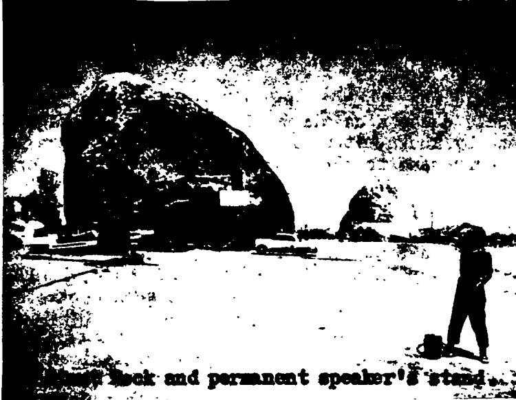
1. Giant Rock and permanent speaker's stand.