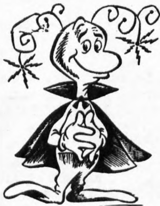
MAN FROM OUTER SPACE?

It is true that my own inquiries fall short of supplying proof of anything, but they do show quite clearly the single purpose of APRO's actions in the case. Not only this, my inquiries show that with additional data it is possible to construct an alternative hypothesis to embrace all the known facts. They also obviate the out of hand denial that the thing could have been a U.S. missile.