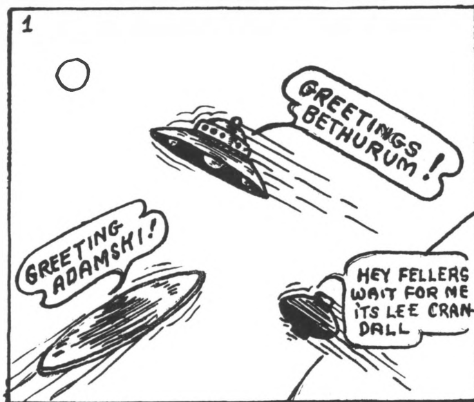
THE SAUCER BOYS

FAMOUS SCIENTIST BELIEVES SAUCERS MAY BE FROM A DISTANT STAR: Clyde Tombaugh, internationally-known scientist and discoverer of the planet Pluto, stated recently that he believes flying saucers may be visitors from the stars, who have traveled trillions of miles to reach Earth. Said Tombaugh: "When we consider the extremely rapid tapping of vast sources of energy, which we have only begun to explore in the last ten years, we can imagine what a head start a race would have which passed our present point of progress a million years, or even a thousand years, before us. Although our solar system is believed to support no life other than that on Earth, other stars in the galaxy may have hundreds or thousands of inhabitable worlds. Races on these planets may have been able to utilize the tremendous amounts of power required to bridge the space between the stars."