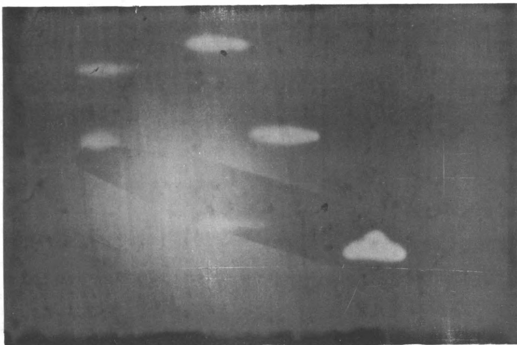
George Adamski, author of "Inside The Spaceships", says this is a photo of a Mother Ship which has just launched six Scout Ships (i.e., flying saucers).

According to the author, he flies in both small and large space-craft; He identifies his principal hosts and hostesses aboard these craft as: Orthon the Venusian, Firkon the Martian and Ramu the Saturnian- all male pilots; Ilmrth, a Martian co-pilot, and Kelna, a Venusian co-pilot (all